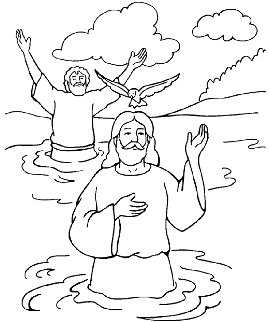
John Baptizes Jesus

From Thru-the-Bible Coloring Pages © 1986,1988 Standard Publishing. Used by permission. Reproducible Coloring Books may be purchased from Standard Publishing, www.standardpub.com , 1-800-323-5473.