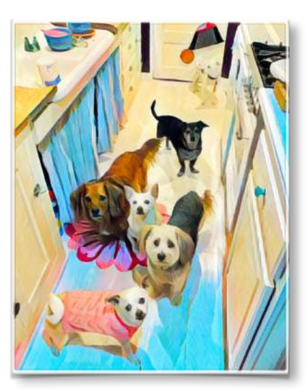
Our current pack ~ Front to Back Emmie, Gracie, Maverick, Banjo Cole and Ace... who is ALWAYS doing his own thing!