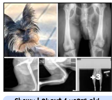
Chewy! about 4 years old, she was used for breeding and dumped. Needed a knee surgery and dental. Rescued by Scratch My Belly Rescue. Helped with vet bills