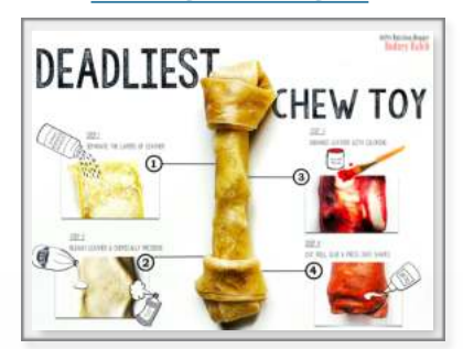
toxic chemicals, choking hazard. NEVER breaks down in the gut & Can Cause DEADLY blockages