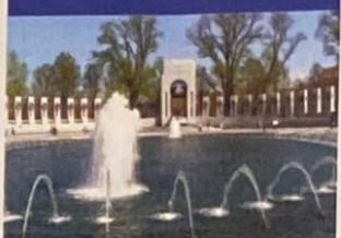
World War II Memorial