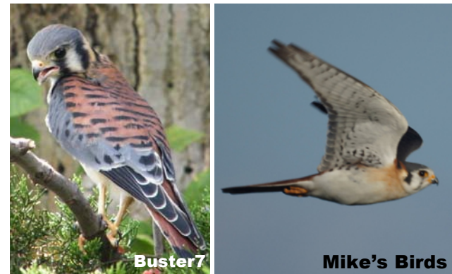
AMERICAN KESTREL Falco sparverius