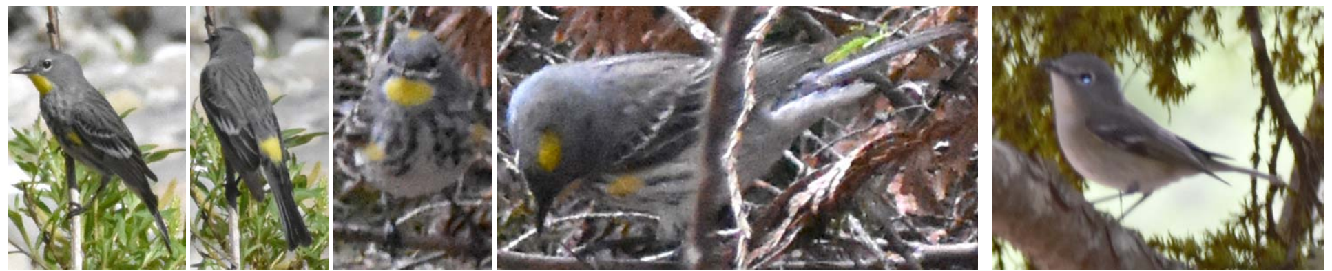
AUDUBON'S WARBLER Setophaga coronata ssp. auduboni

NASHVILLE WARBLER Oreothlypis ruficapilla