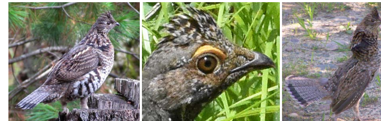
RUFFED GROUSE Bonasa umbellus (Head crest, neck ruff prominent in males)