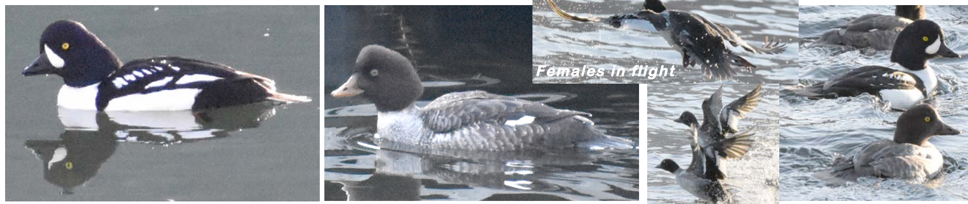
BARROW'S GOLDENEYE Bucephala islandica (Male with purplish head and crescent-shaped white patch between bill and eye, female's head brown)