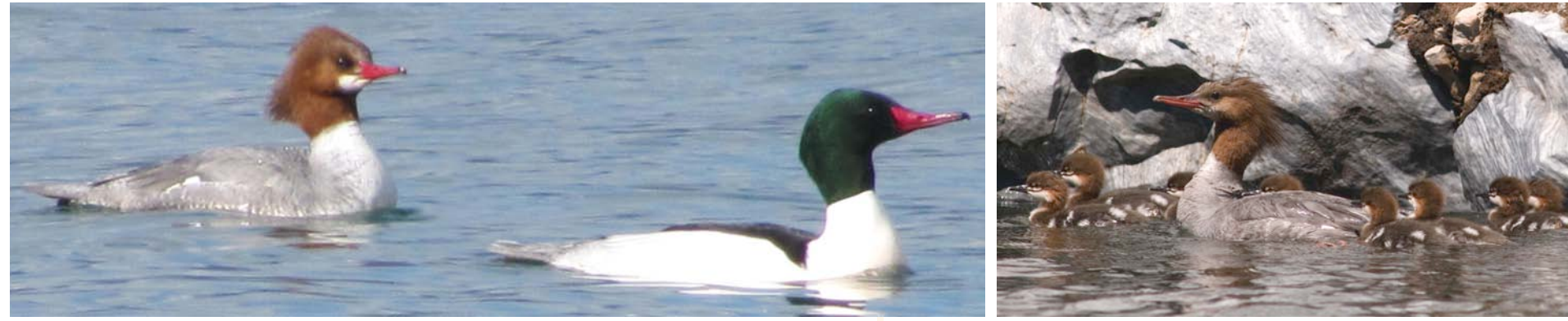
AMERICAN COMMON MERGANSER Mergus merganser ssp.americanus (Female's head brown, male's greenish)