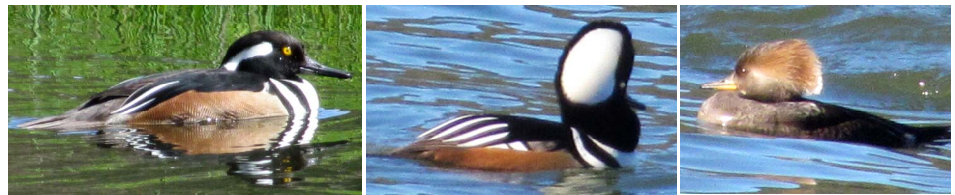
HOODED MERGANSER Lophodytes cucullatus (Male, hood retracted, expanded) (female with yellow on beak)