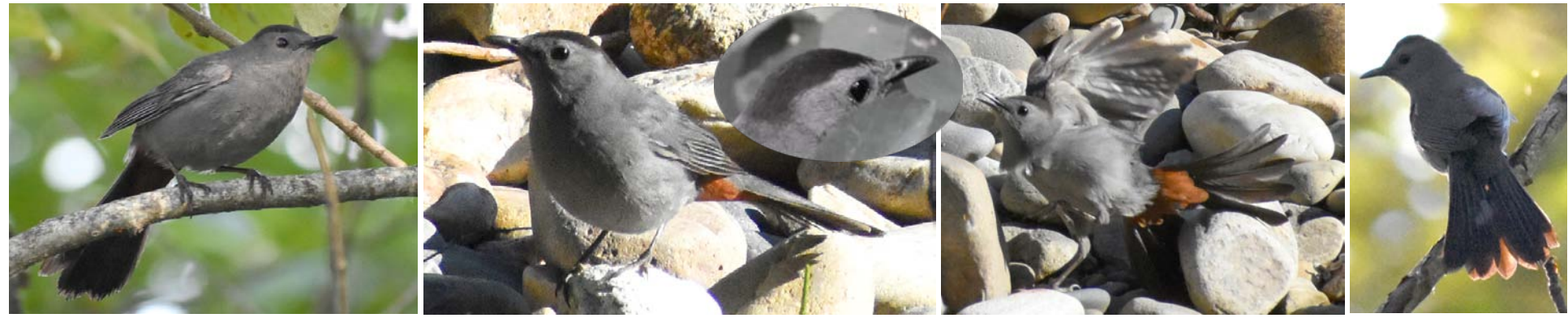
GRAY CATBIRD Dumetella carolinensis

AMERICAN DIPPER Cinclus mexicanus (White waterproof eyelids) GOLDEN-CROWNED KINGLET Regulus satrapa