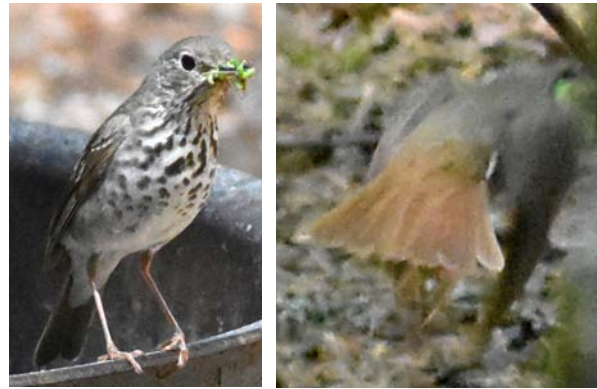
HERMIT THRUSH Catharus guttatus