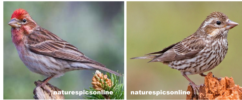
CASSIN'S FINCH Haemorhous cassinii (Brown cheek patch)