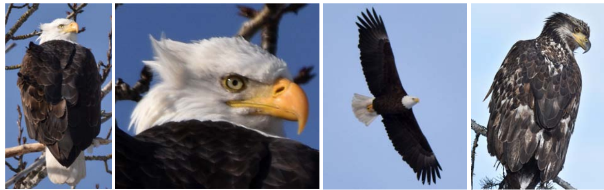
NORTHERN BALD EAGLE Haliaeetus leucocephalus ssp. washingtoniensis