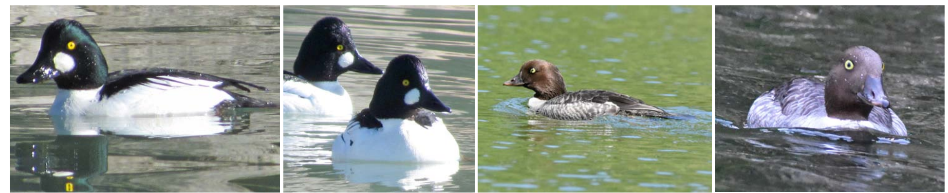
COMMON GOLDENEYE Bucephala clangula (Male with greenish head and round white patch between bill and eye, female's head brown)