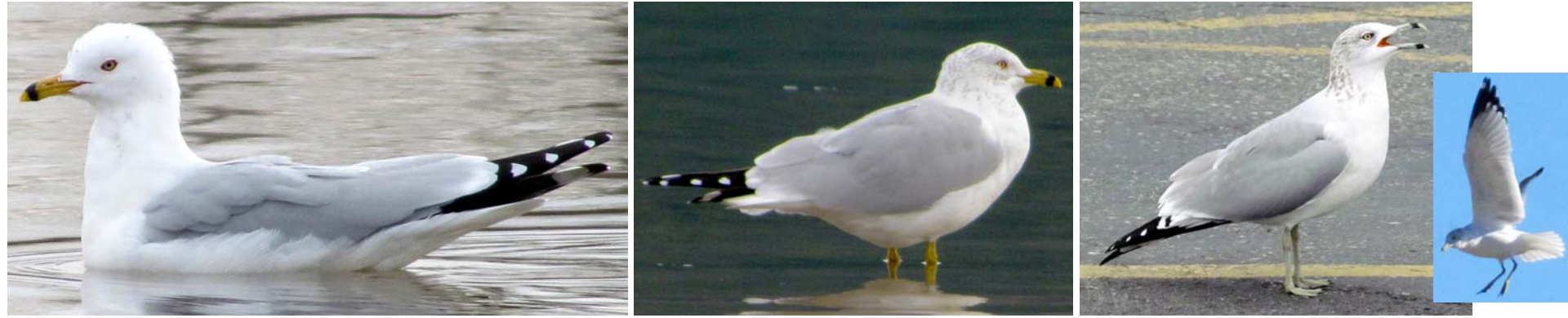
RING-BILLED GULL Larus delawarensis (Adult with yellow bill & legs, no red on bill tip, black ring around bill tip, immature on right)