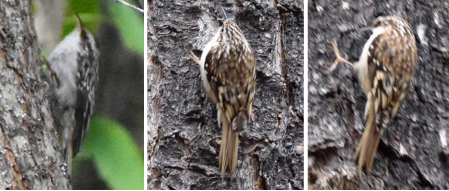
BROWN CREEPER Certhia Americana