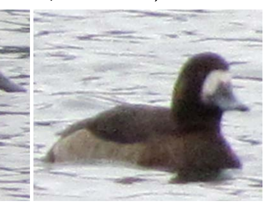
LESSER SCAUP Aythya affinis (Scaup species are very similar)