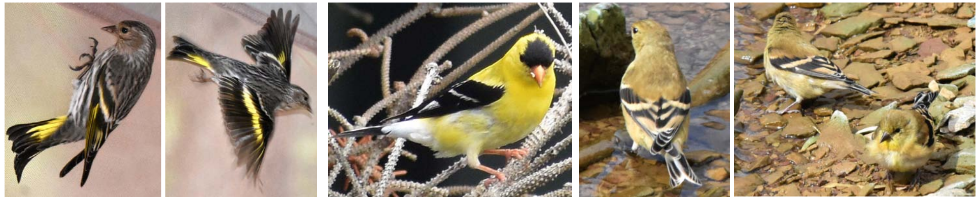
PINE SISKIN Spinus pinus