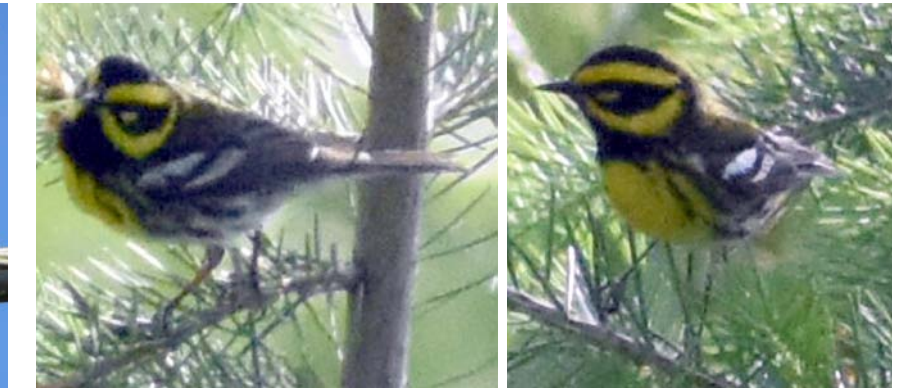
TOWNSEND'S WARBLER Setophaga townsendi