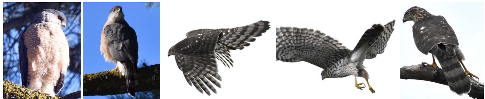
COOPER'S HAWK Accipiter cooperii (Adult with rusty, barred breast, immature in flight and far right)