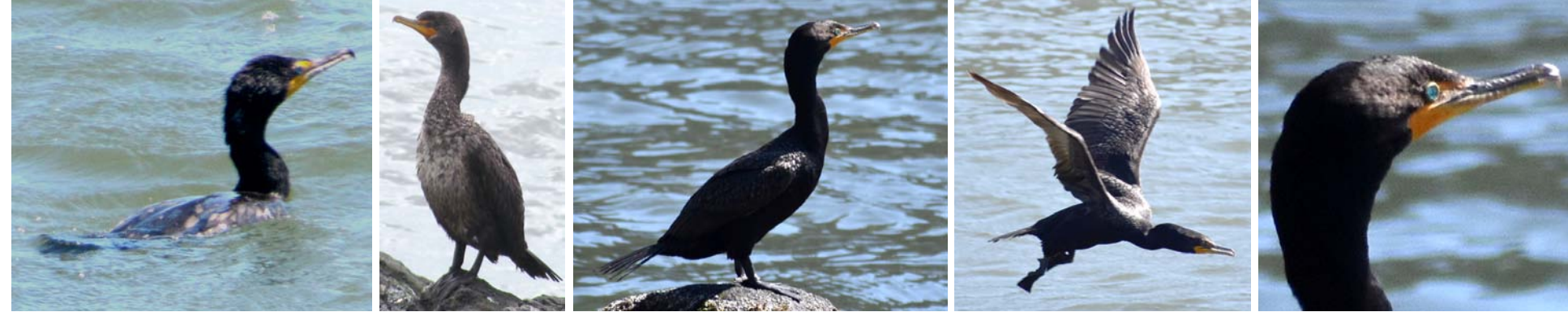
DOUBLE-CRESTED CORMORANT Phalacrocorax auritus (Yellow throat pouch)