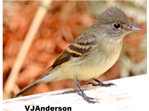
WILLOW FLYCATCHER Empidonax traillii

CORDILLERAN FLYATCHER Empidonax occidentalis