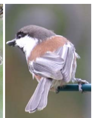
CHESTNUT-BACKED CHICKADEE Poecile rufescens