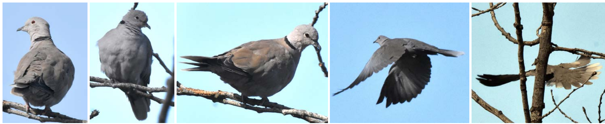
EURASIAN COLLARED DOVE Streptopelia decaocto

BELTED KINGFISHER Ceryle alcyon (Female with rufous belt on chest, male has a fish for chicks)