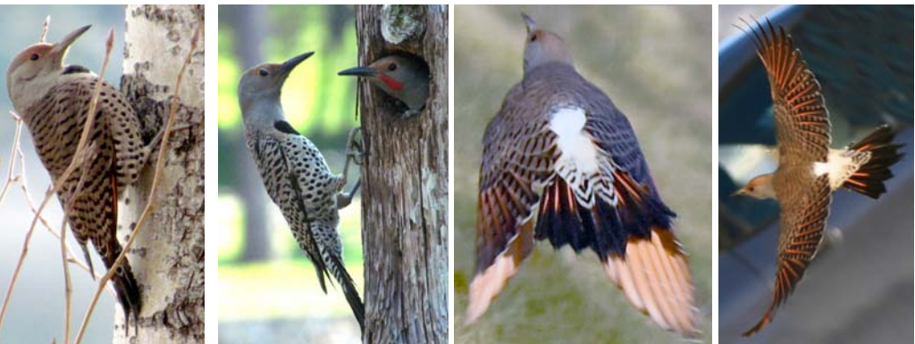
RED-SHAFTED FLICKER Colaptes auratus (Underside of wings in flight salmon colored, male has red cheek, "kyeer" call)

PILEATED WOODPECKER Dryocopus pileatus (Almost big as a crow, male has red stripe on cheek, pecks squarish holes in tree trunks, fast "wuk" series call)