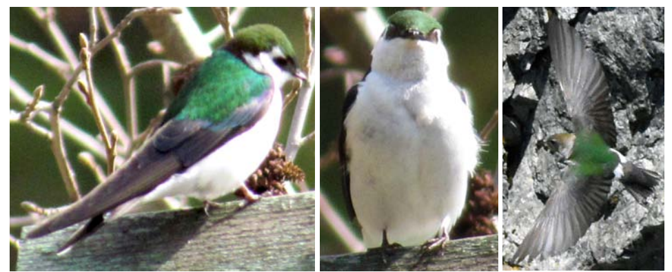
VIOLET-GREEN SWALLOW Tachycineta thalassina (White extends above eye, back green-black, white rump patches in flight)