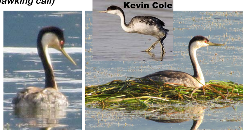
WESTERN GREBE Aechmophorus occidentalis (Builds floating nest, "walks on water" in courtship)