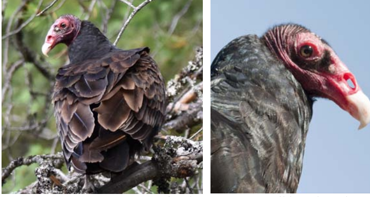
TURKEY VULTURE Cathartes aura (Head red, naked)