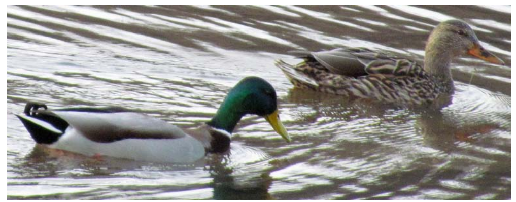
MALLARD Anas platyrhynchos (Male standing, female in flight)