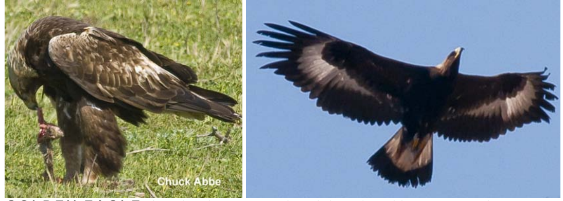
GOLDEN EAGLE Aquila chrysaetos (Dark head and breast, rare)

OSPREY Pandion haliaetus (White breast and throat, eye stripe, frequently seen fishing in lakes, high-pitched whistle calls)