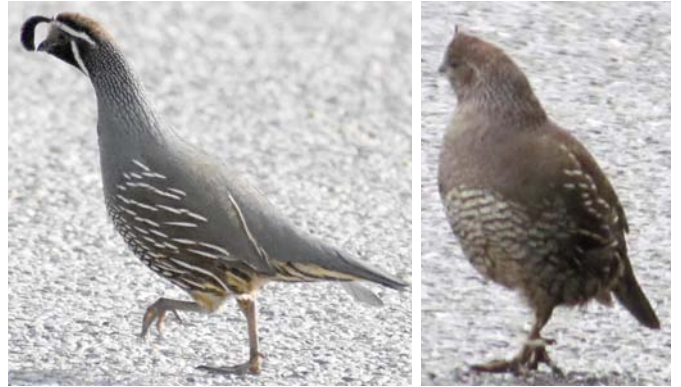
CALIFORNIA QUAIL Callipepla californica ("Comma-shaped" plume on crown of head)