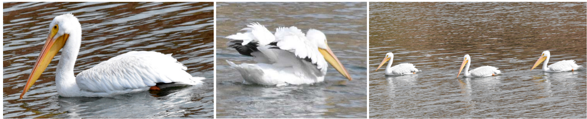
AMERICAN WHITE PELICAN Pelecanus erythrorhynchos