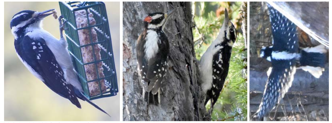
DOWNY WOODPECKER Dryobates pubescens (Short bill, HAIRY WOODPECKER Dryobates villosus (Male has red patch on back of head, body larger than Downy Woodpecker and bill much longer)