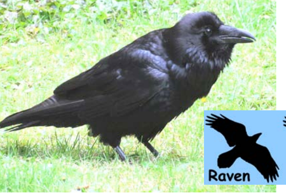
COMMON RAVEN Corvus corax (Larger than crow, heavier bill, back of tail rounded or "V" shaped in flight)