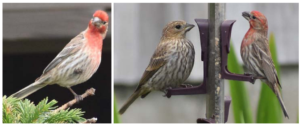
HOUSE FINCH Haemorhous mexicanus