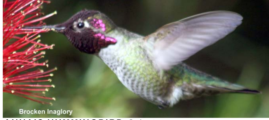
ANNA'S HUMMINGBIRD Calypte anna