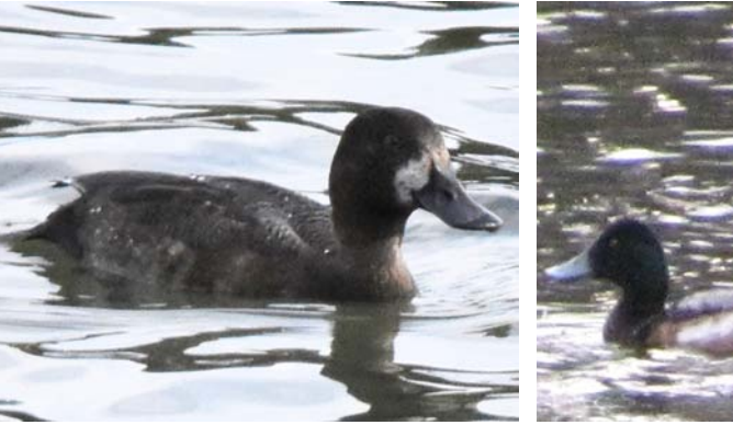
GREATER SCAUP Aythya marila