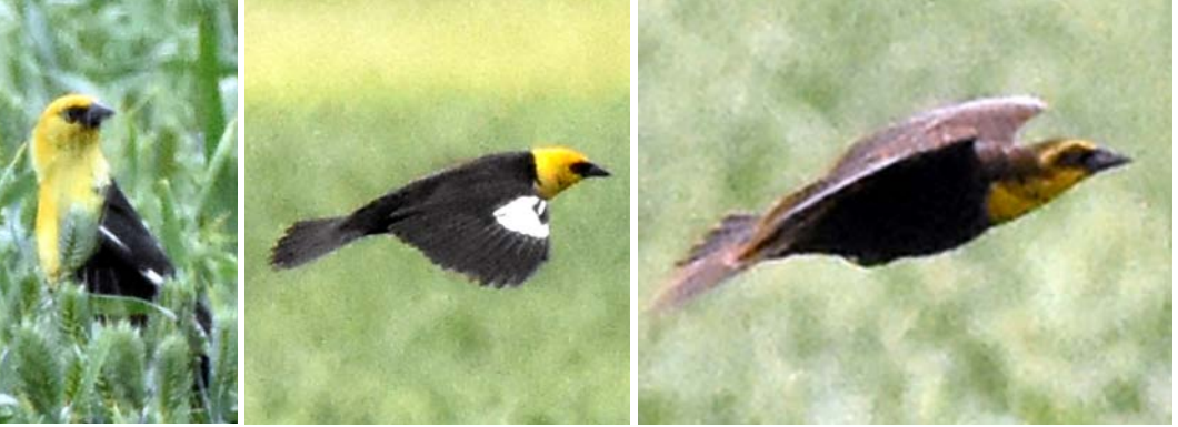
YELLOW-HEADED BLACKBIRD Xanthocephalus xanthocephalus