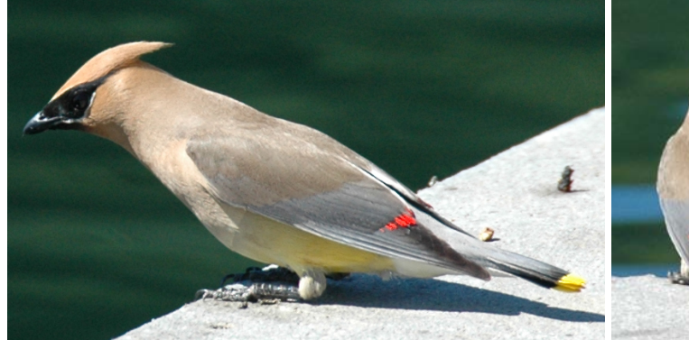
CEDAR WAXWING Bombycilla cedrorum (White under rump)