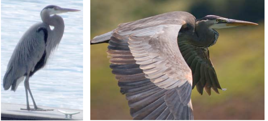
GREAT BLUE HERON Ardea herodias