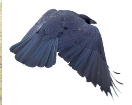
AMERICAN CROW Corvus brachyrhynchos (Tail square in back)