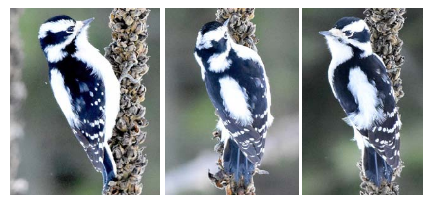
color and pattern very similar to Hairy Wodpecker)