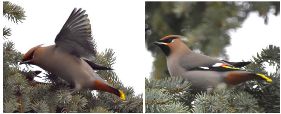
BOHEMIAN WAXWING Bombycilla garrulous (Red under rump)