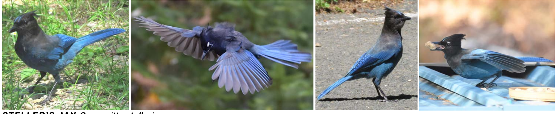
STELLER'S JAY Cyanocitta stelleri