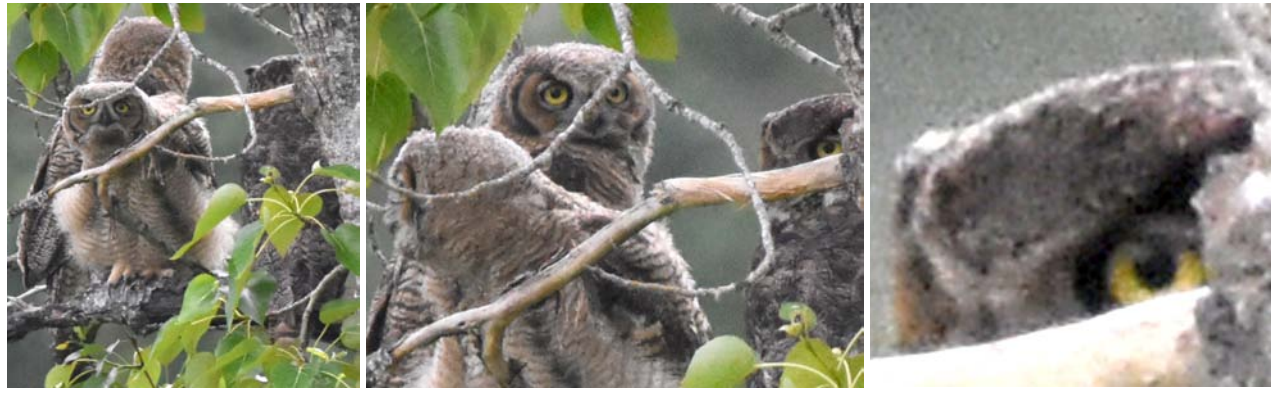
GREAT HORNED OWL Bubo virginianus

Glaucidium gnoma (A tiny owl, "eye-like spots on back of head)