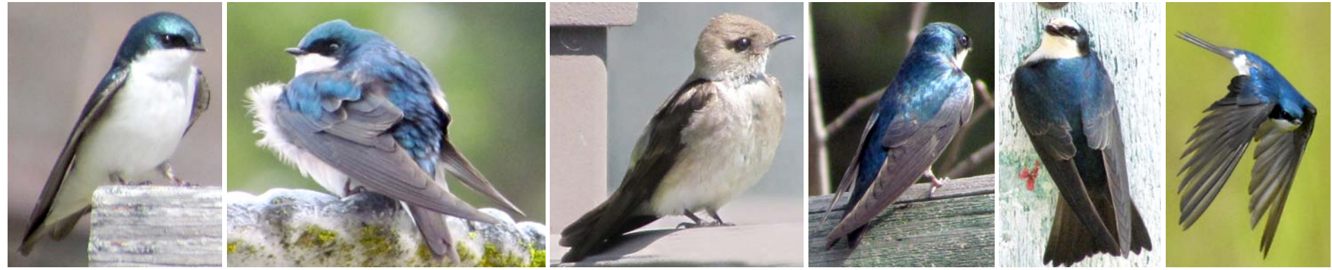
TREE SWALLOW Tachycineta bicolor (White throat and breast, white doesn't extend above eye, back blue-black, immature grayish, catches insects in flight)