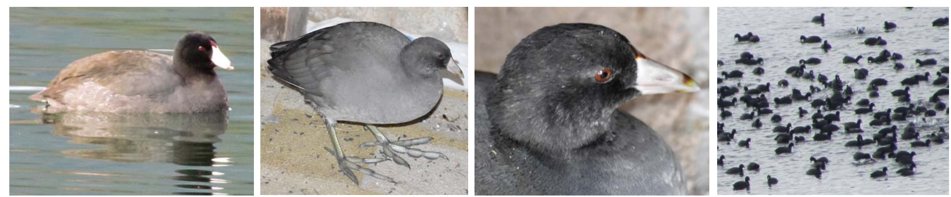
AMERICAN COOT Fulica americana ("Chicken-like" in appearance, assemble in rafts of hundreds)