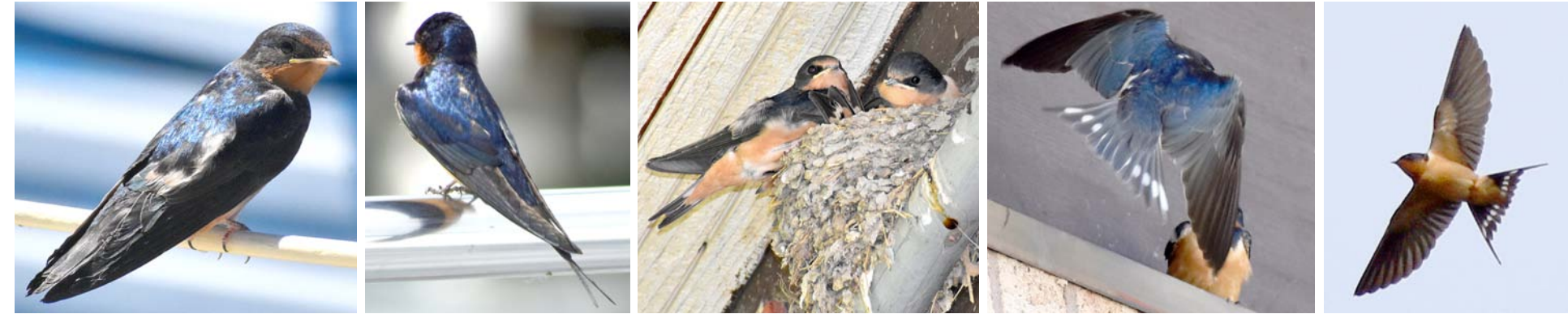
BARN SWALLOW Hirundo rustica (Forked "swallow tail" conspicuous in flight)

NORTHERN ROUGH-WINGED SWALLOW Stelgidopteryx serripennis