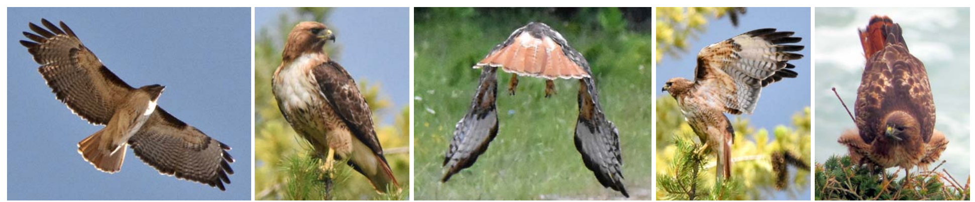
RED-TAILED HAWK Buteo jamaicensis