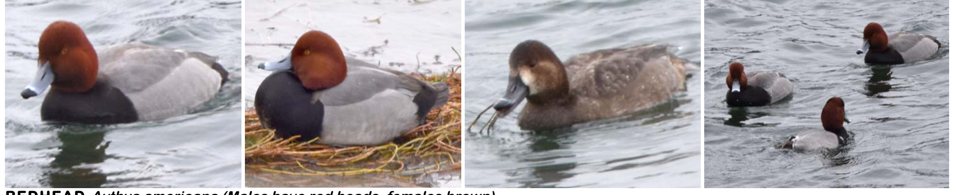
REDHEAD Aythya americana (Males have red heads, females brown)