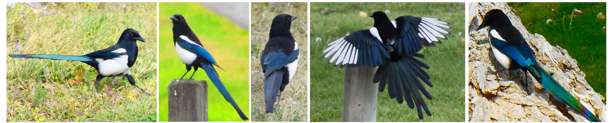
BLACK-BILLED MAGPIE Pica hudsonia