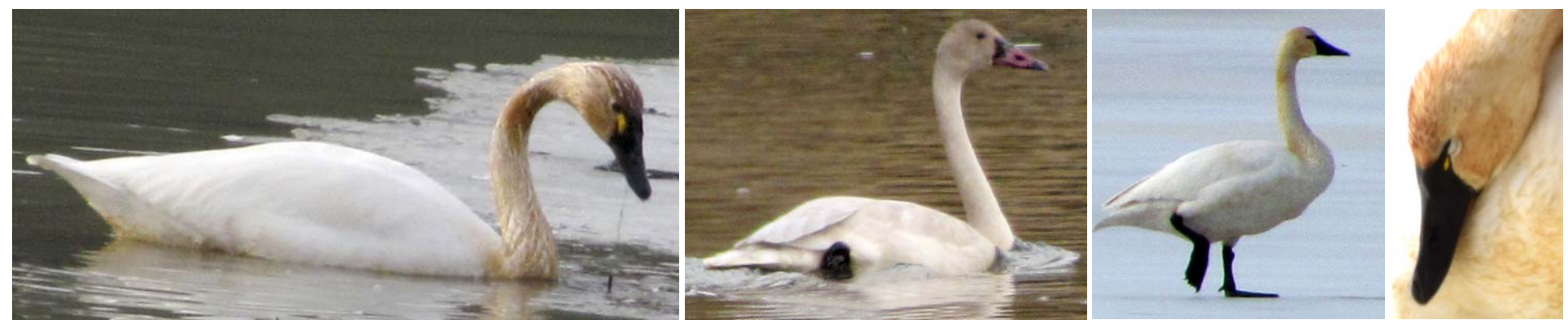
TUNDRA SWAN Cygnus columbianus (Adults have dark beak with yellow spot before eye, immature with reddish-yellow beak)