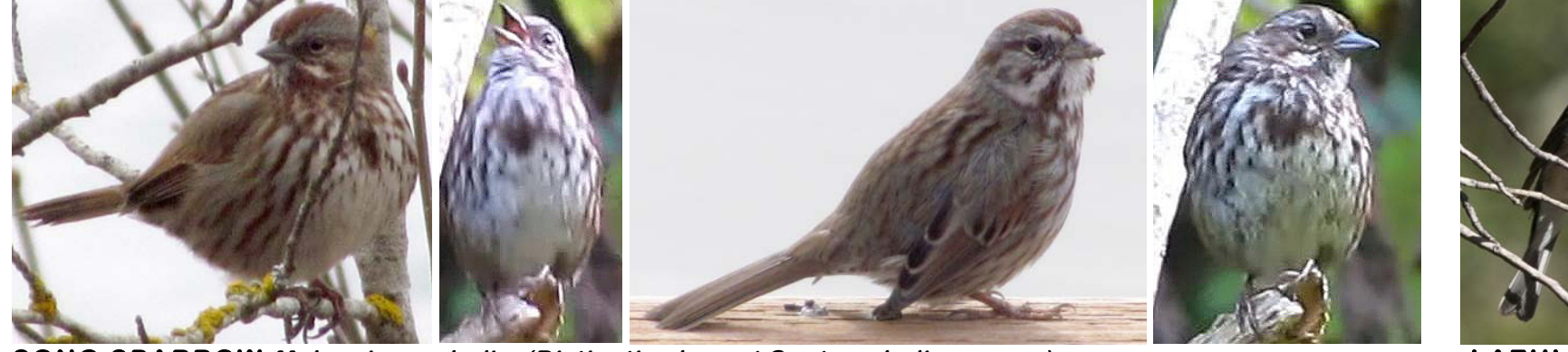
SONG SPARROW Melospiza melodia (Distinctive breast Spot, melodious song)