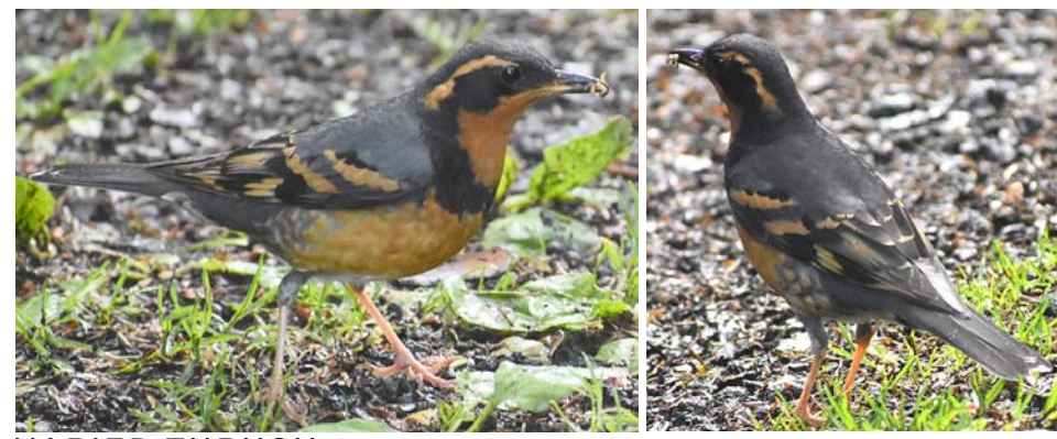
VARIED THRUSH Ixoreus naevius