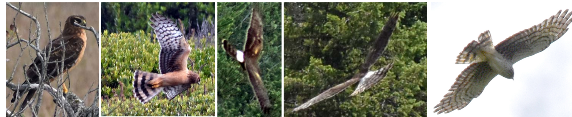
NORTHERN HARRIER Circus hudsonius (White rump patch conspicuous in flight)