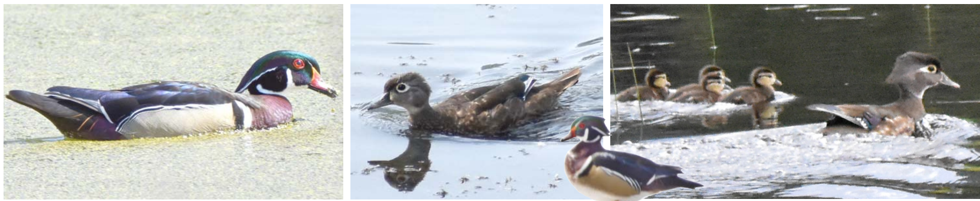
WOOD DUCK Aix sponsa (Male colorfully patterned, female has white eye ring)