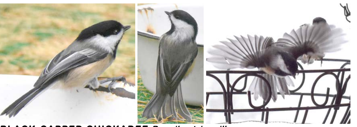
BLACK-CAPPED CHICKADEE Poecile atricapillus

Thomas Quine Elsette Lebailit BROWN-HEADED COWBIRD Molothrus ater