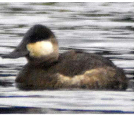
RUDDY DUCK Oxyura jamaicensis