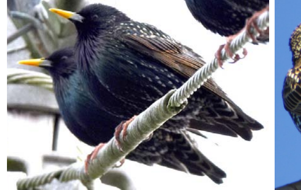
EUROPEAN STARLING Sturnus vulgaris