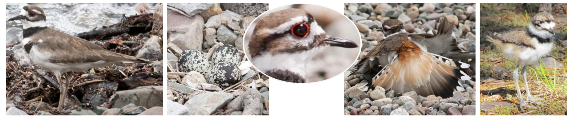
KILLDEER Charadrius vociferous (Nests on beaches, please take care)