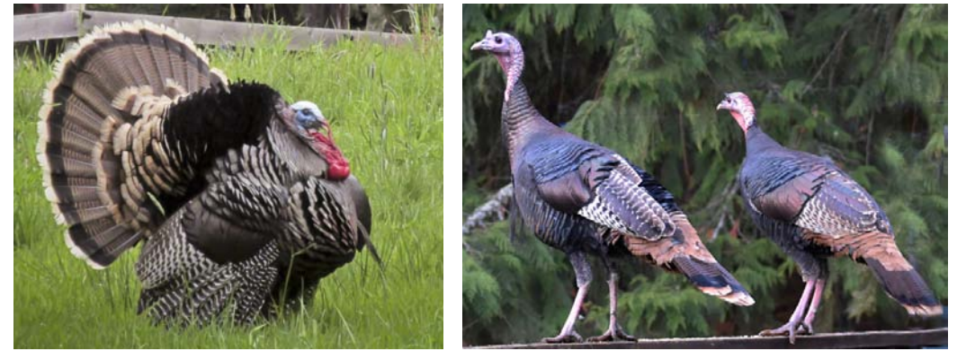
WILD TURKEY Meleagris gallopavo (Hanging beard on male's breast)