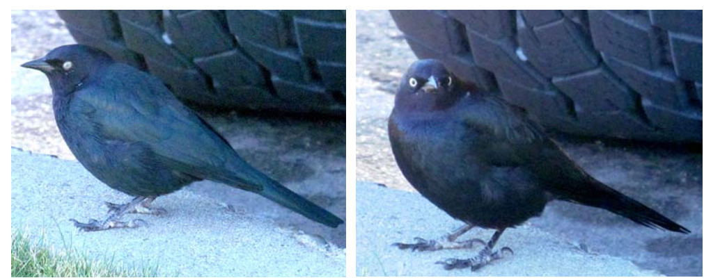
BREWER'S BLACKBIRD Euphagus cyanocephalus