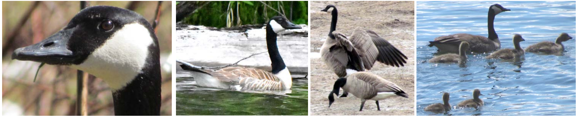
CANADA GOOSE Branta canadensis (Loud honkers, walk around beaches and docks, leave droppings everywhere)

TRUMPETER SWAN Cygnus buccinators (Larger than Tundra Swan, adults have dark beak" without" yellow spot before eye)