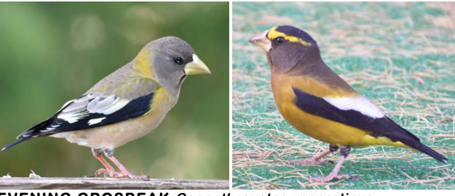
EVENING GROSBEAK Coccothraustes vespertinus (Male has yellow brow)