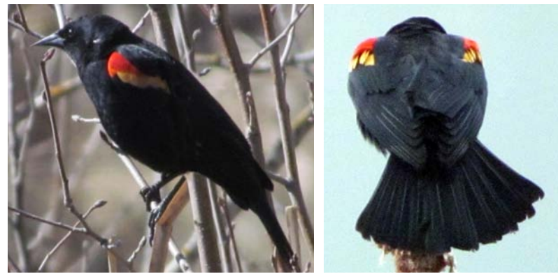
REDWING BLACKBIRD Agelaius phoeniceus (Nests in marshes, high-pitched "ricochet-like" call)