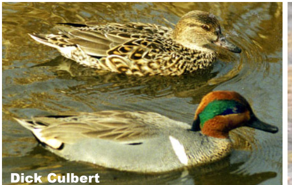
GREEN-WINGED TEAL Anas crecca