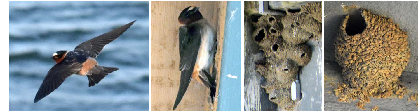
CLIFF SWALLOW Petrochelidon pyrrhonota