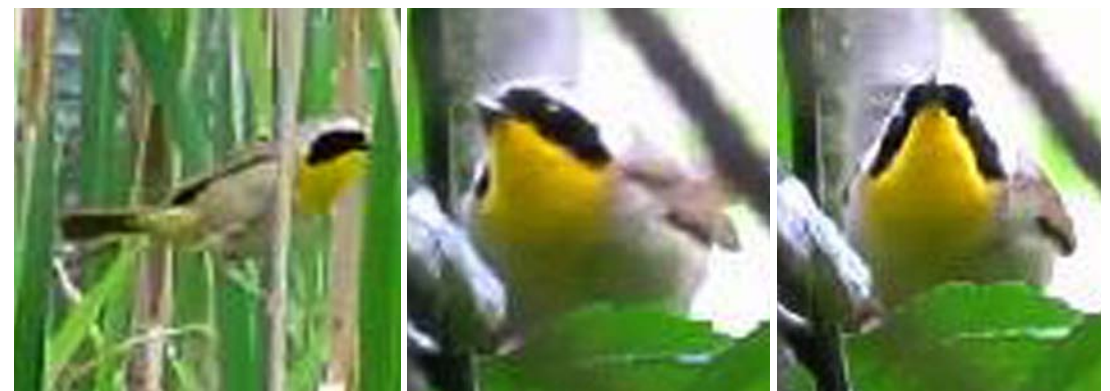
COMMON YELLOWTHROAT Geothlypis trichas