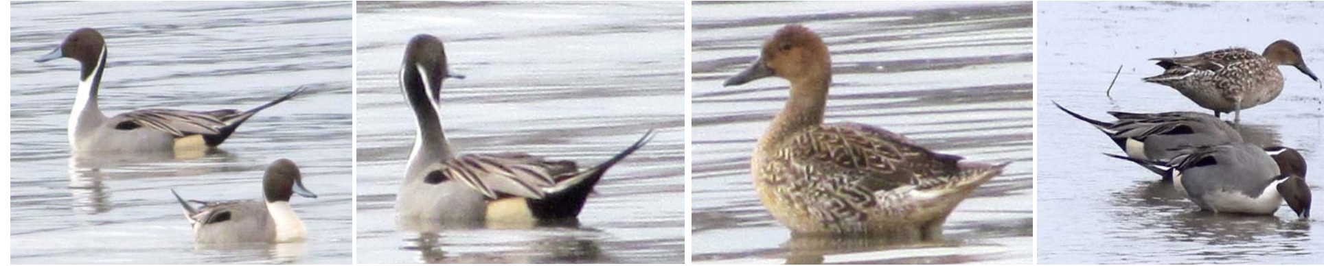
NORTHERN PINTAIL Anas acuta (Male has white "bib" and neck stripes, female mottled brown)