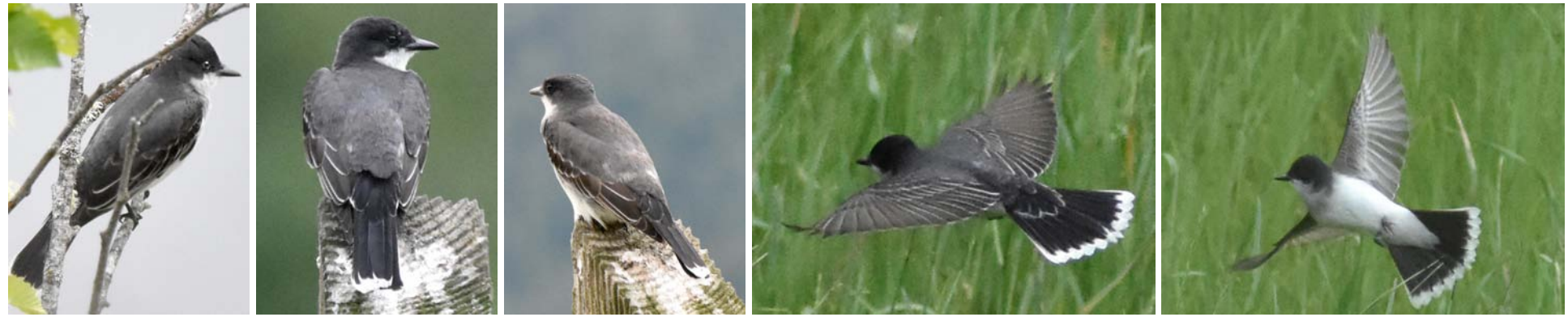
EASTERN KINGBIRD Tyrannus tyrannus