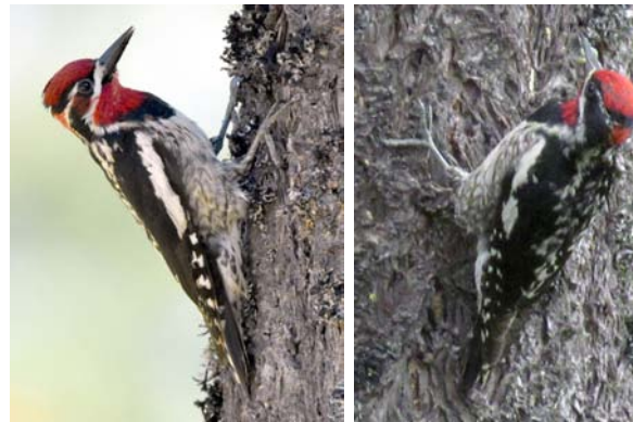
RED-NAPED SAPSUCKER Sphyrapicus nuchalis