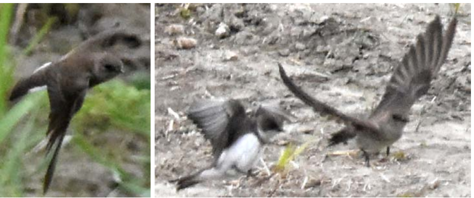
BANK SWALLOW Riparia riparia