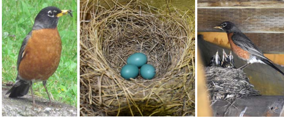
AMERICAN ROBIN Turdus migratorius