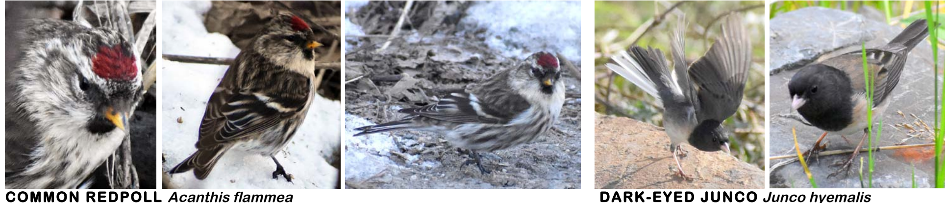
DARK-EYED JUNCO Junco hyemalis