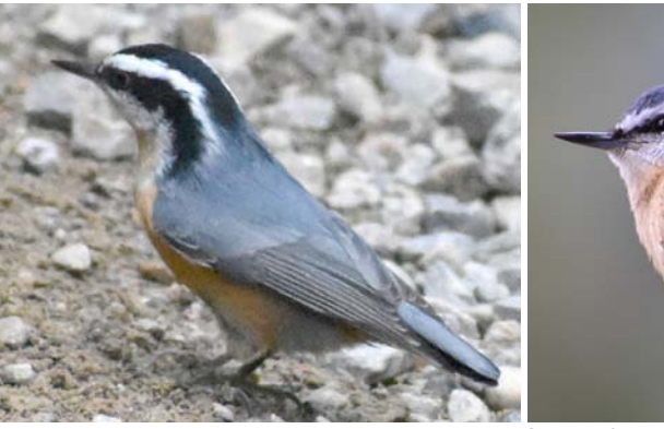
RED-BREASTED NUTHATCH Sitta Canadensis