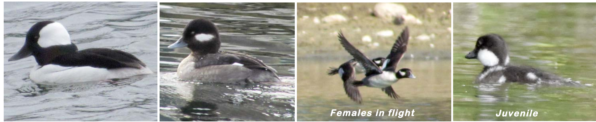
BUFFLEHEAD Bucephala albeola (Male with broadly white nape behind eye, female has smaller patch behind and below eye)