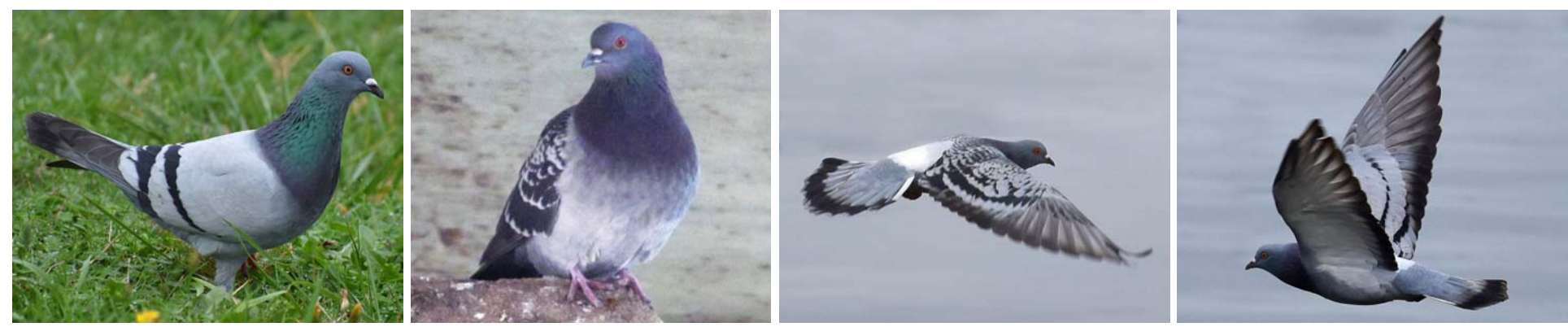
ROCK PIGEON Columba livia (Roosts under bridges)