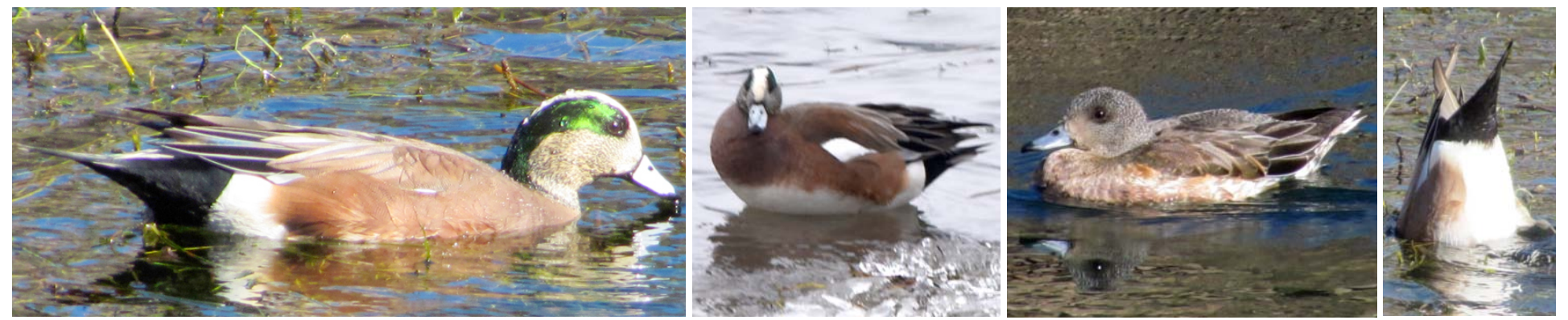
AMERICAN WIGEON Anas americana