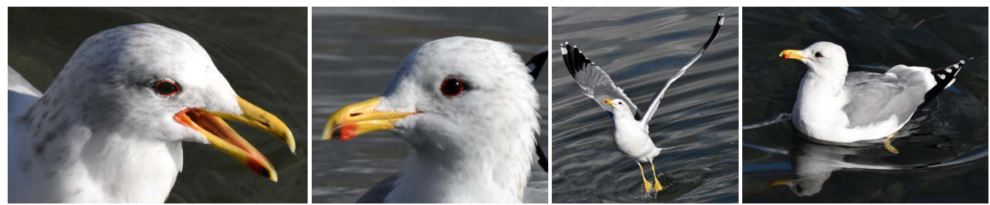
CALIFORNIA GULL Larus californicus (Red blotch on lower bill near tip with black dots)