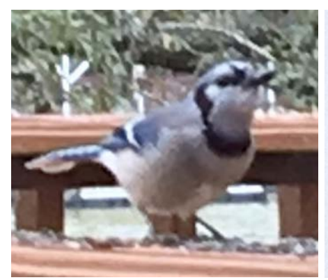
BLUE JAY Cyanocitta cristata