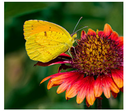
Sleepy Orange Sulphur Dolph McCranie