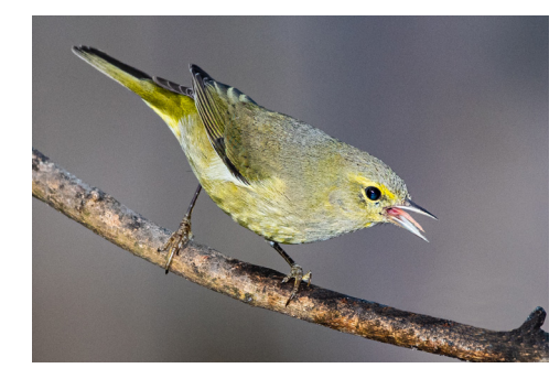
Yellow Warbler Dolph McCranie