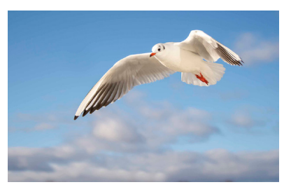
Out the Window Stennis Shotts