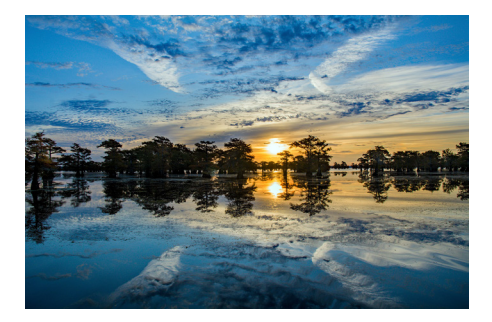
Symmetrical Sunrise Beverly Lyle