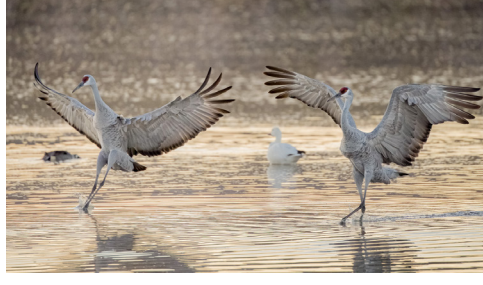
Twin Touchdowns Larry Peruffo