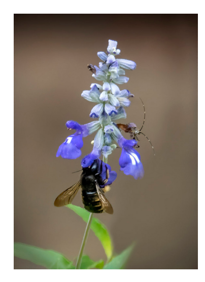
Watch Out! Lois Schubert