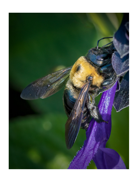
Bumblebee Rose Epps