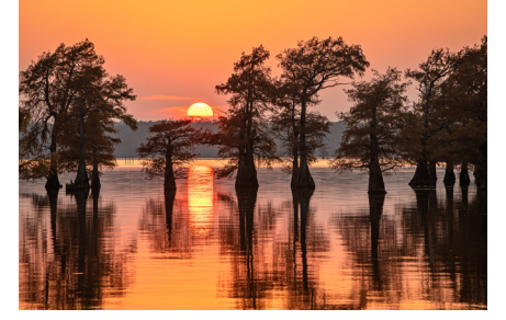
Caddo Lake Sunset Larry Peruffo