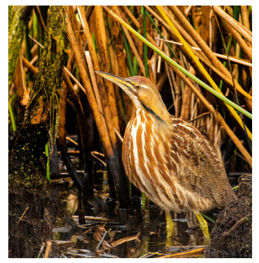
Bittern Stennis Shotts