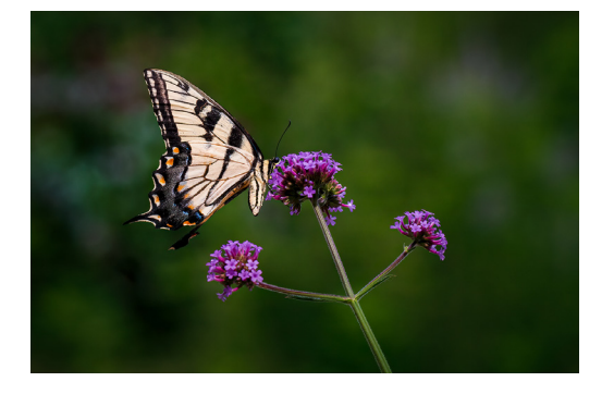
Swallowtail Butterfly Rose Epps