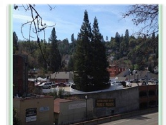
#9 Parking Garage Planter