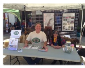
Public outreach and fundraising for our Monument Garden Project located on Bedford Ave.