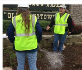
#10 (garden walk cover) Hangtown Creek Project and Mountain Meadow Garden at the Welcome Sign area.