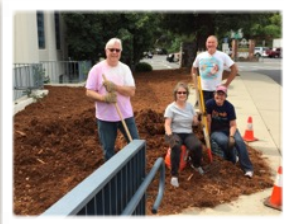
Monument Garden Project ~ A planned pocket park and place for peaceful reflection in our downtown area.