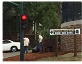
Planned Ore Cart "river of gold" Garden at Gold Bug Park sign located at US 50.