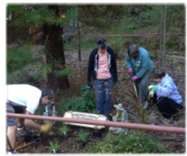
Gold Bug Park Garden Project at the museum walk to the gold mine.