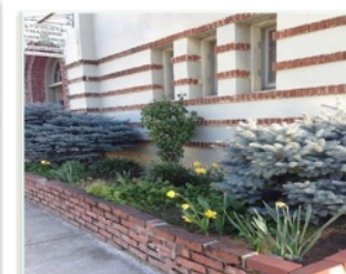
#4 EDC Chamber Garden