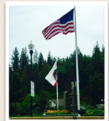
Welcome Sign Area Garden Project.