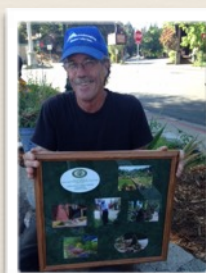
Community Spirit Award presented by Community Pride Committee.