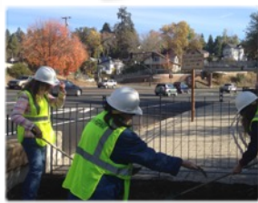
#11 Adopt-A-Hwy Wildflowers at various locations along US 50, El Dorado Trail and Randolph Creek.