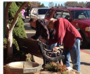
#6 Old City Hall Gardens