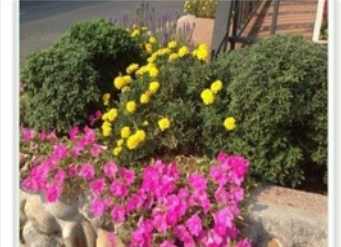
#7 Bell Tower Garden