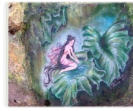
Fairy murals scattered along our gardens at the old City Hall buildings.