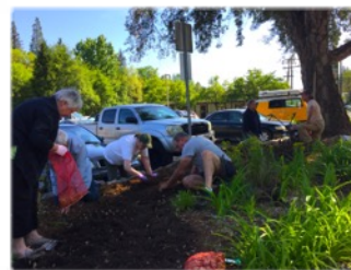
#2 Ivy House Garden