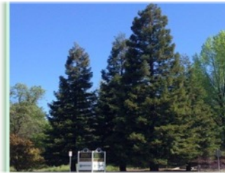
#1 Redwoods at Broadway