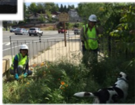
Shade Tree & Zen Garden near Hangtown Creek & Randolph Creek confluence.