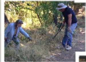
Randolph Creek Native Plant Demonstration Garden Project.