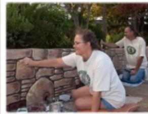
Garden Wall mural at our Mooney lot garden near the old Soda Works building.