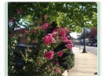
#8 Fox Lot Gardens