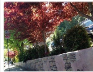
#3 Mooney Lot Garden