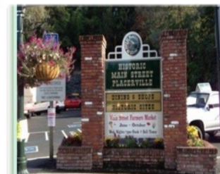
#5 Main St. at Bedford Ave.