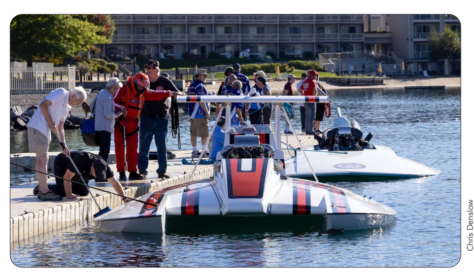
Vintage hydros at the dock getting ready to go onto Lake Chelan.

On Friday, October 6, the only boats that ran were vintage Unlimiteds, giving rides to a number of people, including many who had patiently waited during the Covid shutdown to finally have their wish fulfilled. Boats that gave rides included the replica Miss Wahoo in its 1957 configuration, the replica Miss Thriftway