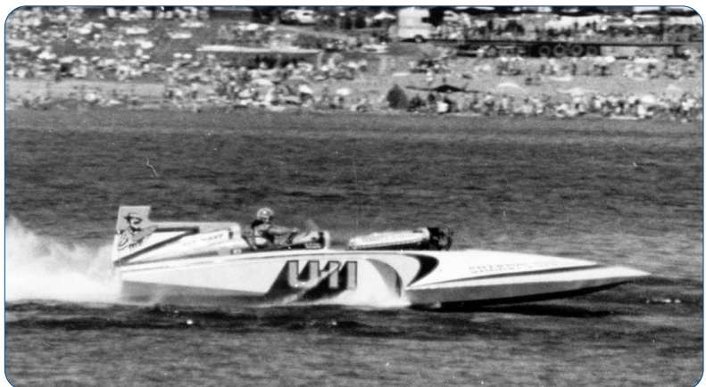
The U-11 Shakey's Special is it appeared in 1973.

At this speed I had expected a deafening roar and searing heat. The noise was noticeable, but because of the helmet's insulation, the level of sound wasn't as loud as a trailer test. The heat streaming back made it possible to ride without a long-sleeved shirt (ala Chuck Thompson) on an otherwise cold day.