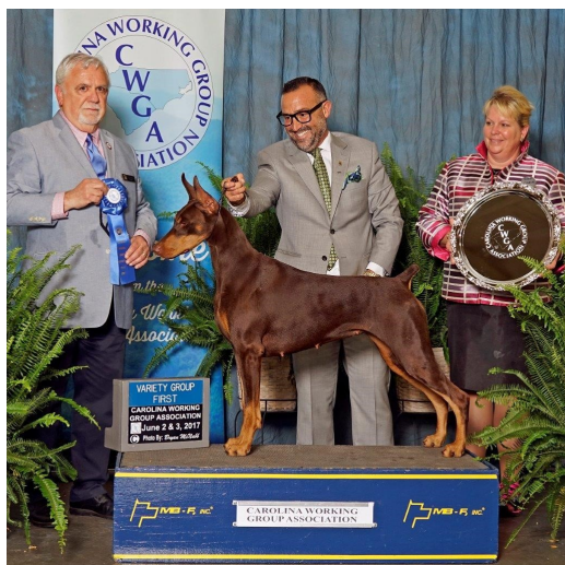
GCH Phillmar Lois Lane