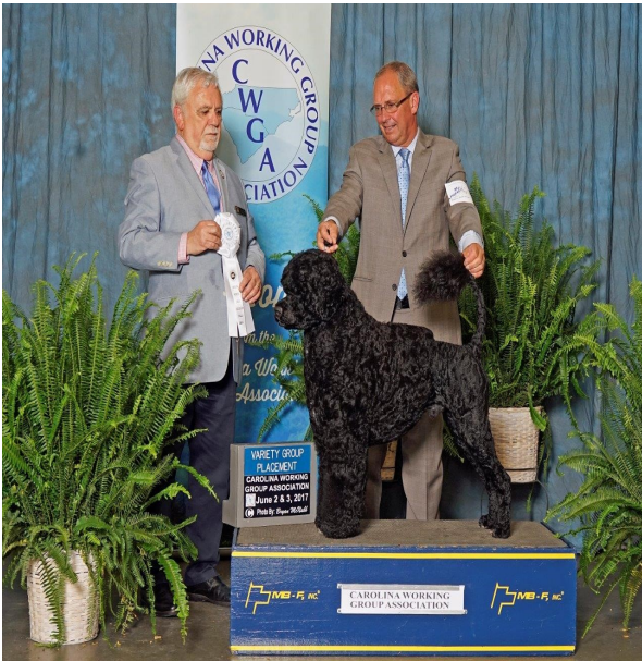
GCH Pouch Cove in the Paint