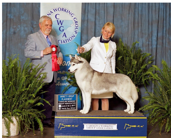
GCH SharinNick of Dynasty RC Kennel