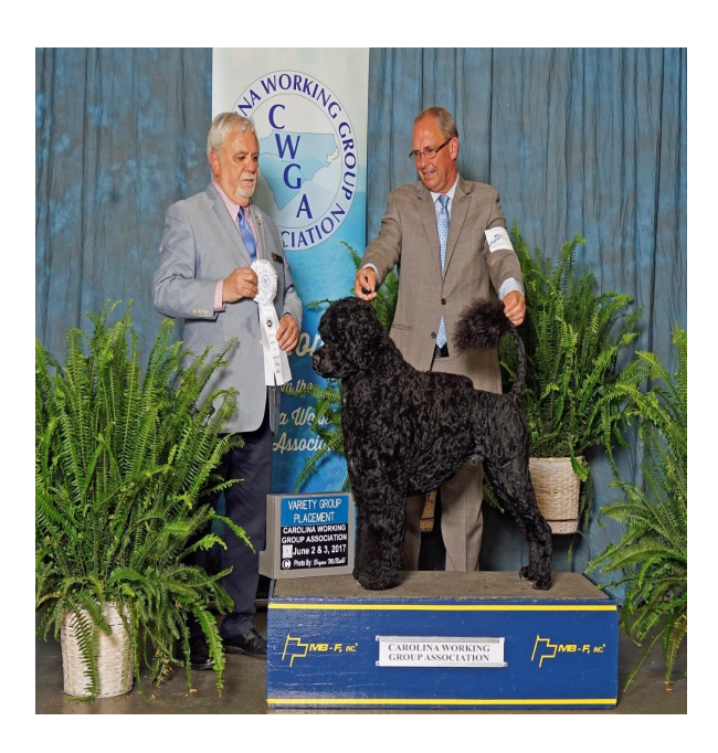
GCH Pouch Cove in the Paint