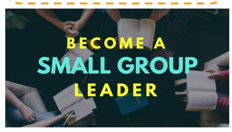
We are seeking leaders to establish groups similar to the ones listed above for singles, couples without children, or any other life stage that may interest you! Contact the church office to learn more!

Trinity Social Club is a casual group that will gather monthly to connect, share life, and get to know each other by visiting different restaurants or activities in the area. The first meeting of the Trinity Social Club will be March 16th at Rayz in Genoa at 6:00 pm. This is going to be a kid free activity so plan your babysitters and be ready to enjoy the Trinity Social Club. To RSVP to Susie Shaffer (419-344-0673)