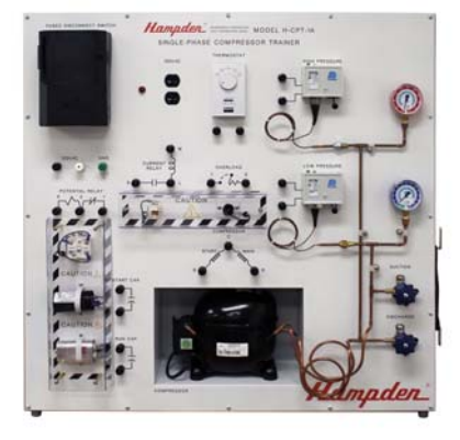
MODEL H-CPT-1A Dimensions: 36"H x 36"W x 13"D Shipping Weight: 260 lbs

All Hampden units are available for operation at any voltage or frequency