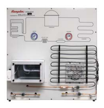
MODEL H-FRD-1A Dimensions: 36"H x 36"W x 13"D Shipping Weight: 272 lbs