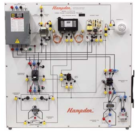
Model H-TPCT-1A Dimensions: 36"H x 36"W x 13"D Shipping Weight: 254 lbs