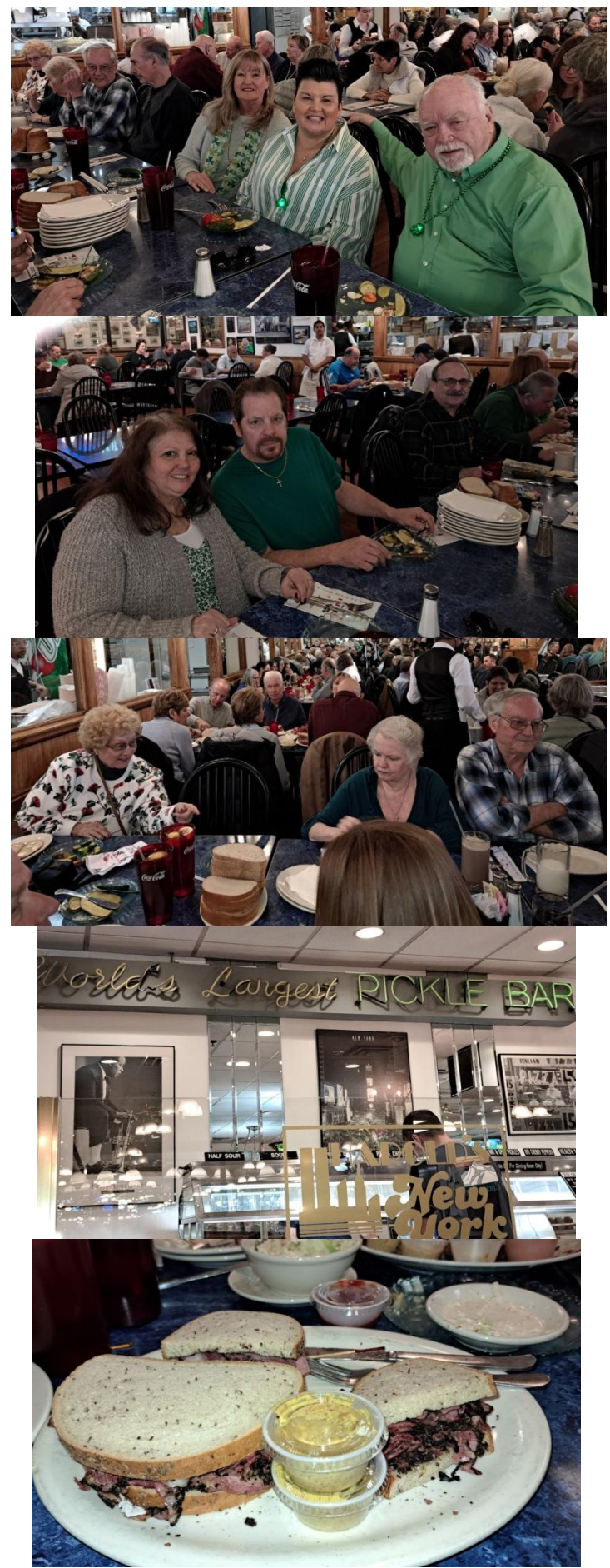
This was my take home