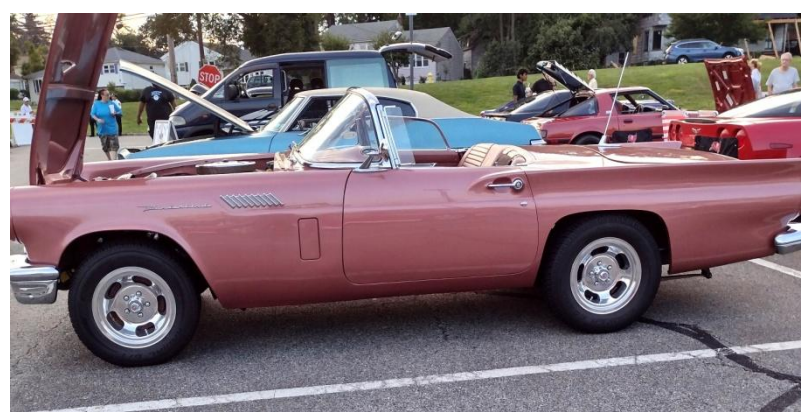
Gerry Ingersoll's 57