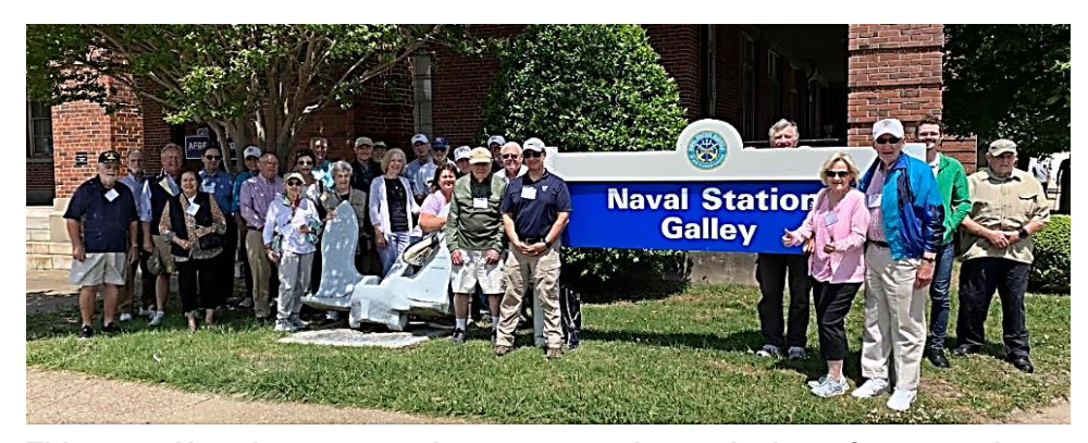
Thirty-two Navy Leaguers and guests returning to the bus after a very interesting tour on the USNS Harvey Milk .