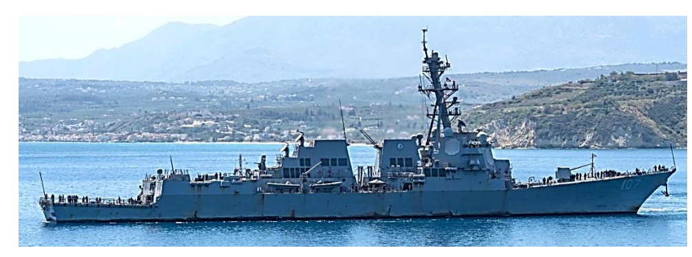
USS Gravely on April 28, 2024, at Souda Bay, Crete.

Pictures of USS Gravely while deployed to the U.S Naval Forces Central Command / U.S. 5<sup>th</sup> Fleet area of operations to support maritime security and stability in the Middle East.