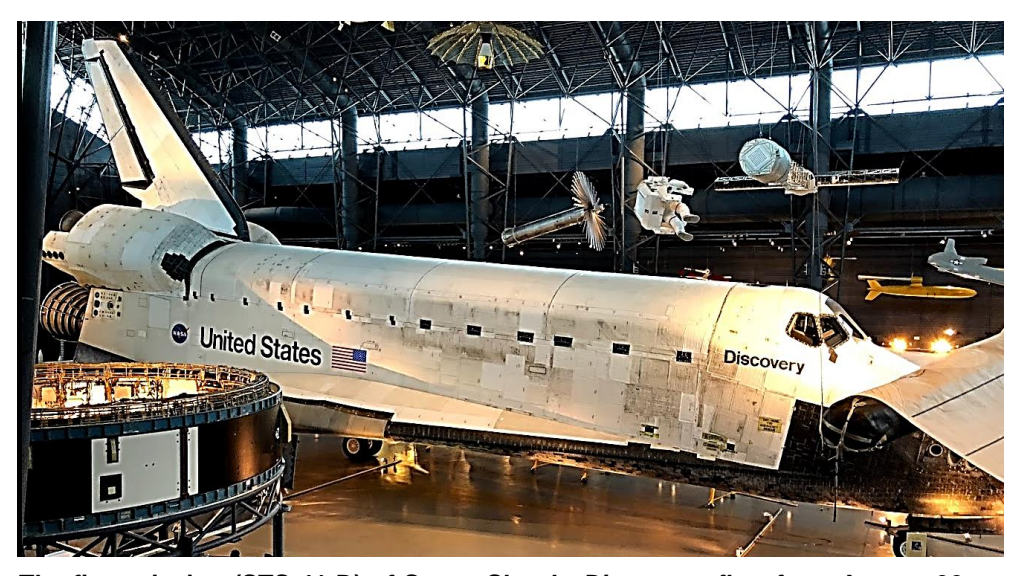
The first mission (STS-41-D) of Space Shuttle Discovery , flew from August 30 to September 5, 1984. Over 27 years of service it launched and landed 39 times, aggregating more spaceflights than any other spacecraft to date. (Wikipedia).