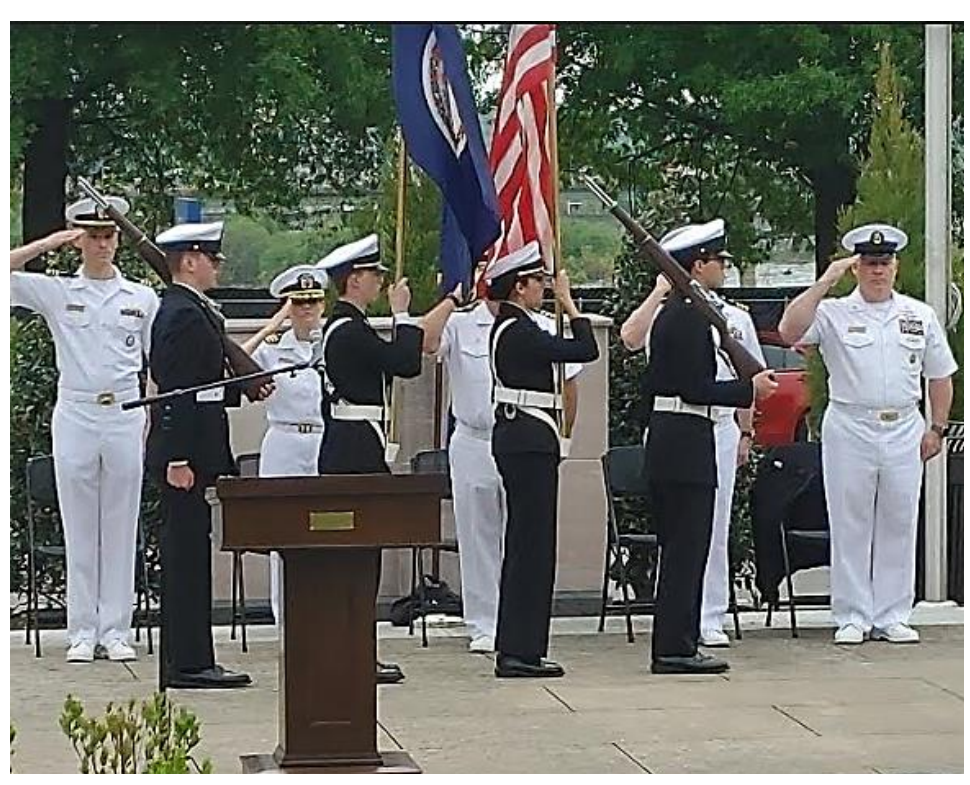
Mechanicsville High School NJROTC Color Guard presents the colors before the Change of Command Ceremony.