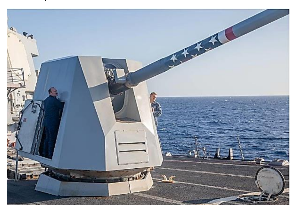
May 15, 2024 - Deployed to the Red Sea with the Eisenhower Strike Group. USS Gravely 5-inch gun.

April 2024, Sailor's practice firehose handling during a damage control drill aboard USS Gravely in the Red Sea. (Photo by Petty Officer 1<sup>st</sup> Class Jonathan Word).