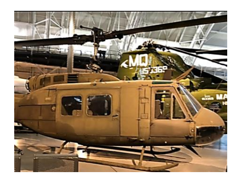
U.S. Army helicopter (H-60). The most versatile rotary-wing air-frame that has served in the U.S. Military.

Picture on right is the Lockheed P-38J-10-LO Lightning, one of the most successful twin-engine fighters ever flown by any nation. Lightning pilots in the Pacific theater downed more Japanese aircraft than pilots flying any other Army Air Forces warplane.