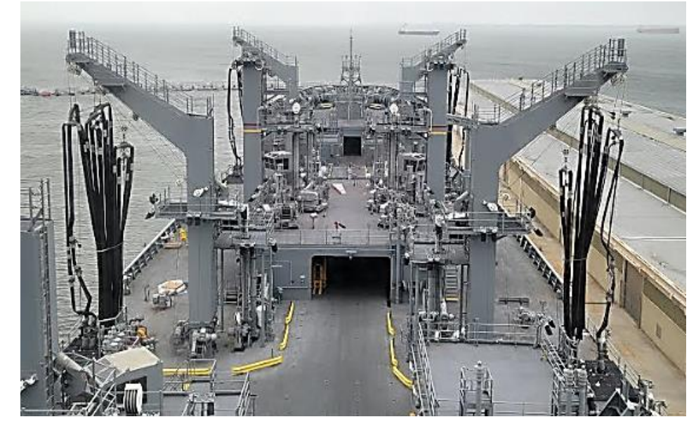
Arial photo from the Control Room depicts the equipment utilized during fuel replenishment missions.