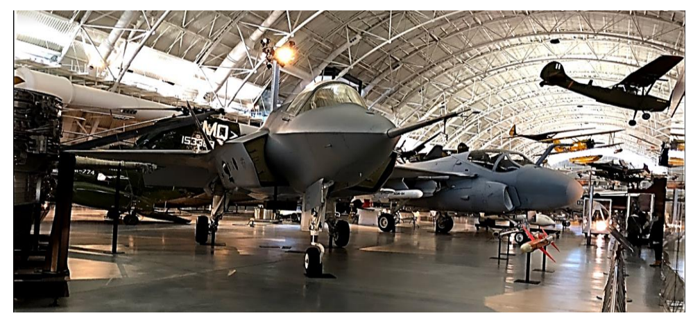
On July 20, 2001, the X-35B Joint Strike Fighter was the world's first short takeoff, level supersonic dash, and vertical landing in a single flight.