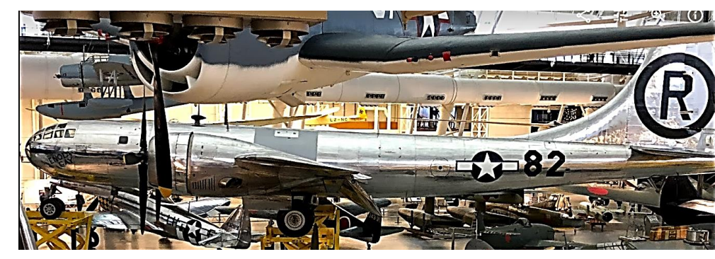
Boeing B-29 Superfortress Enola Gay was the most sophisticated propeller-driven bomber of World War II, and the first bomber to house its crew in pressurized compartments. On August 6, 1945, Enola Gay dropped the first atomic weapon used in combat on Hiroshima, Japan.