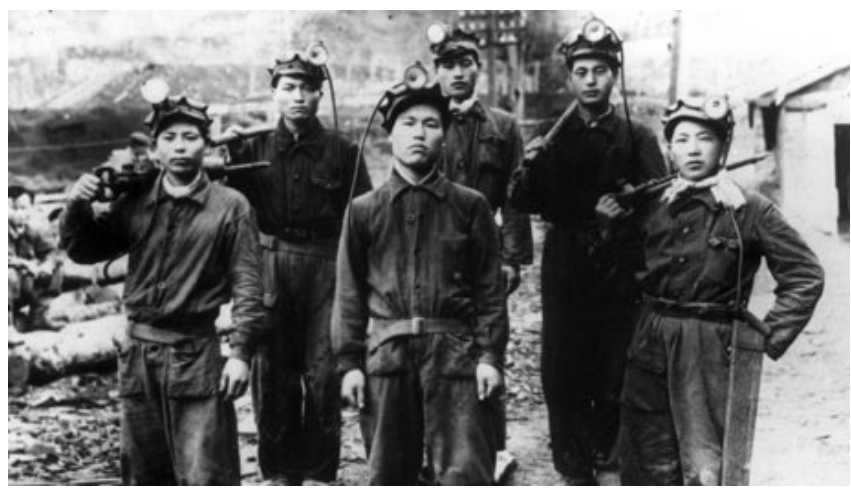
Korean coalminers in Sakhalin

In recent years the Japanese government, quietly and on "humanitarian grounds," has helped fund the repatriation to South Korea of some Sakhalin Koreans, more than 40,000 of whom endured a harsh Cold War existence as "stateless persons" on the island controlled by the former Soviet Union. As many as 150,000 Koreans were brought to Sakhalin between 1910 and 1945, many of them to work in Japanese coal mines and lumber yards. The latest repatriation efforts are described by the Korean Overseas Information Service in the article below. (Background information on the difficult history of Sakhalin's Koreans can be found at Wikipedia.)