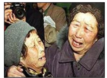
Repatriates to Korea from Sakhalin

Incheon is one of several residential areas currently available for the Sakhalin Koreans, along with those in Seoul and Ansan. The returnees are entitled to a monthly government allowance of about 400,000 won ($425) per person if they have no income.