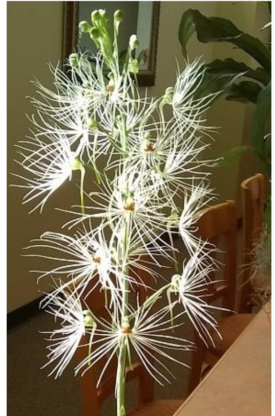
Habenaria medusa is a terrestrial orchid found growing in hot Asian grasslands. It requires a long dry winter to bloom.

Oct. 31-Nov. 3, 2018 The American Orchid Society 2018 Fall Members Meeting is being held in conjunction with the International Slipper Orchid Symposium in Apopka, Florida.