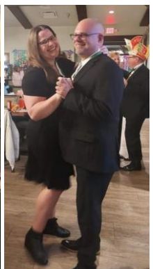
Horrah, Harrah! Der Hoppeditz ist wieder da!