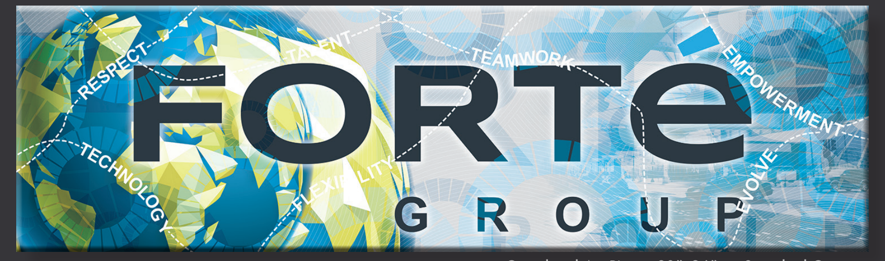
Completed Art Piece - 90"x26" on Stretched Canvas