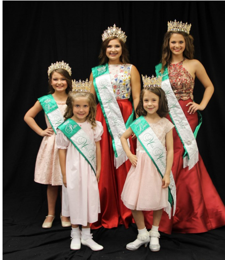
Picture on the left: front row from left: Petite Miss Maurepas, Little Miss Maurepas; back row from left: Preteen Miss Maurepas, Miss Maurepas and Junior Miss Maurepas

On October 5 th , Maurepas School hosted its 13 th Annual Beauty Pageant. The event was a big success with a lot of contestant. Although we are proud of all the beautiful girls who participated, we want to congratulate the winners.