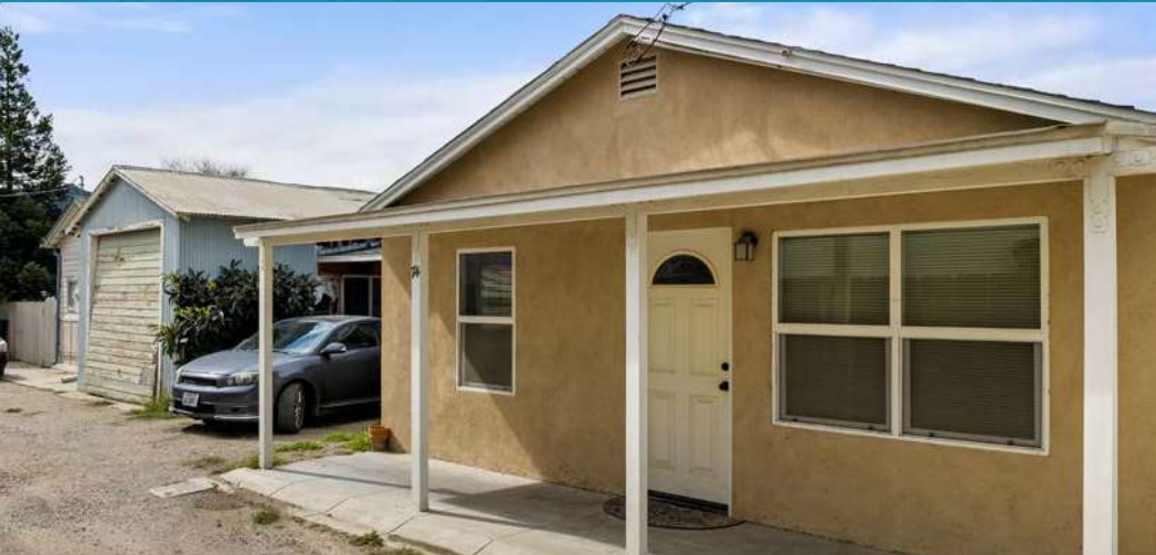
78 W HWY 246

74 Zaca St • 78 W. Hwy 246 | Buellton CA 93427