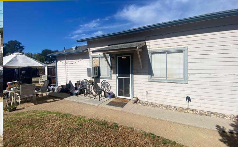
1 BR/1 BA Guest House