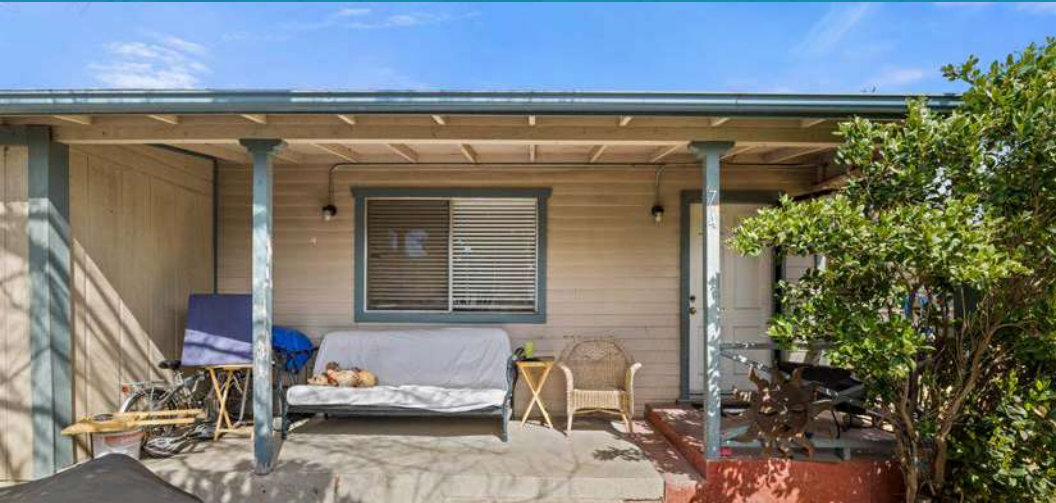
74 ZACA ST

74 Zaca St • 78 W. Hwy 246 | Buellton CA 93427