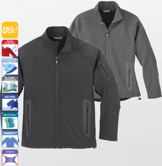
88138 & 78060 ASH CITY - NORTH ENDTHREE-LAYER FLEECE BONDED SOFT SHELL TECHNICAL JACKET