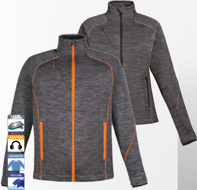
88697 & 78697 ASH CITY - NORTH END SPORT RED FLUX MÉLANGE BONDED FLEECE JACKET