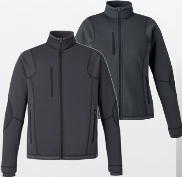
88681 & 78681 ASH CITY - NORTH END SPORT RED PULSE TEXTURED BONDED FLEECE JACKET WITH PRINT