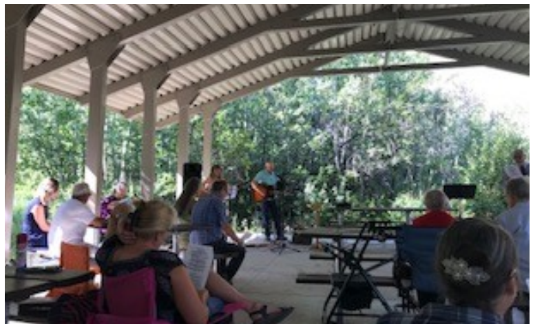
Our first 2021 worship in the canyon ~ June 20th