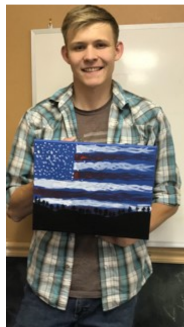
Our 2021 graduates and their parents~