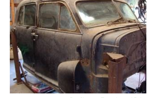
The Hoosier Tailfin 10