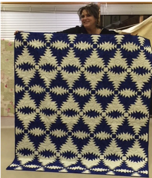
Pineapple by Charlene.