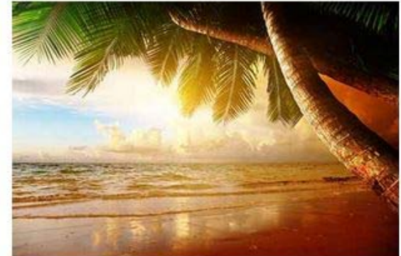
Video Coming Soon...