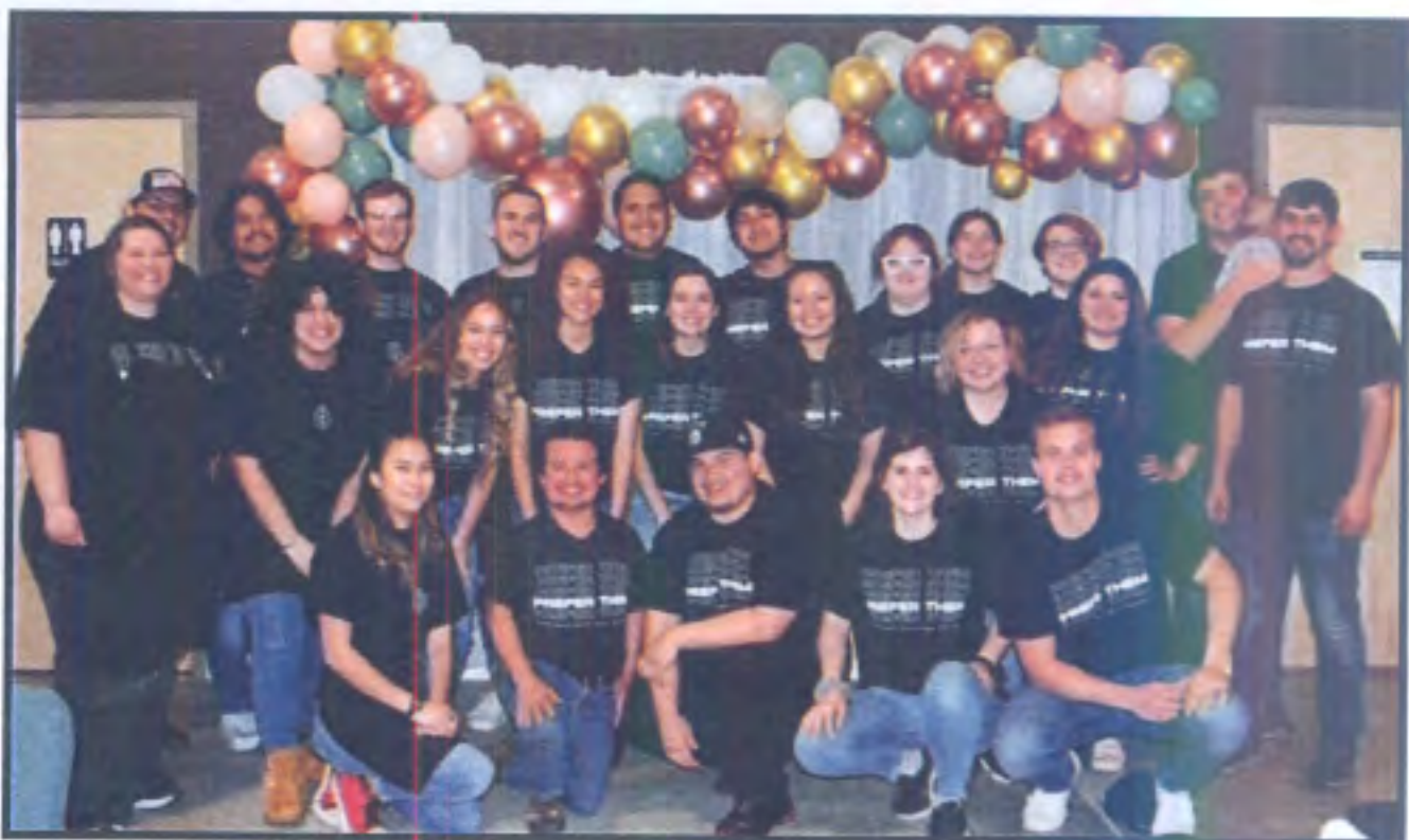
Students and Staff That Served BBQ

Over 100 people gathered at the conclusion of the school year for the annual AFBC Alumni and Friends Banquet. The theme this year was "joy comes in the morning": from Psalm 30:5, "for his anger is but for a moment, his favor is for life: weeping may endure for a night, but joy cometh in the morning." The last two years have been difficult for many of us both collectively and personally, but God has been faithful and has brought joy out of the dark night. The banquet was a time to celebrate all that God has brought us through.