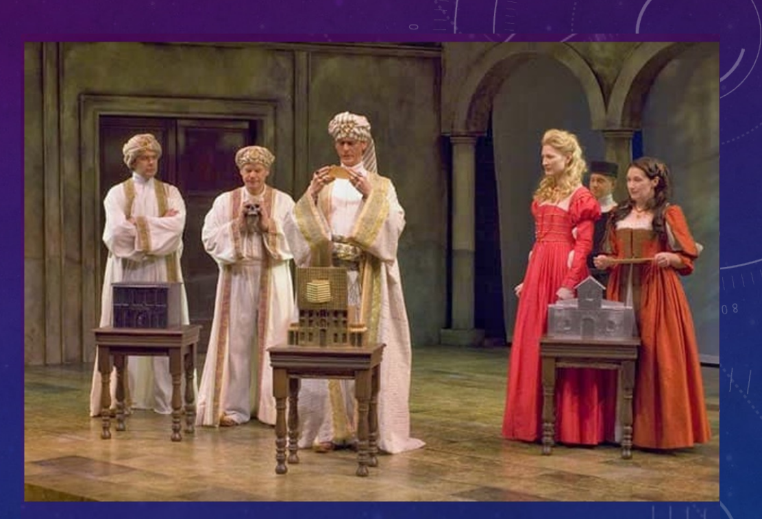
Prince of Morocco reads 'all that glitters is not gold' note from the gold casket.

• All that glisters [glitters] is not gold; Often have you heard that told: Many a man his life hath sold But my outside to behold: Gilded tombs do worms infold. Had you been as wise as bold, Young in limbs, in judgment old, Your answer had not been inscroll'd: Fare you well; your suit is cold.