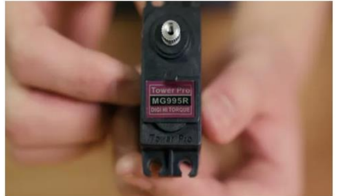
Fig.2: High Torque Servo, Tower Pro MG995R (System Requirement).

In figure 2 the high-torque servo motor is show, specification and features are listed below This High-Torque MG996R Advanced Servo highlights metal equipping bringing about additional high 10kg slowing down torque in a minor bundle. The MG996R is basically an overhauled adaptation of the popular MG995 servo, and highlights updated stun sealing and an upgraded PCB and IC control framework that make it significantly more exact than its antecedent. The outfitting and engine have likewise been moved up to improve dead band with and focusing. The unit comes total with 30cm wire and 3 stick 'S' type female header connector that fitsmost collectors, including Futaba, JR, GWS, Cirrus, Blue Winged creature, Blue Bolt, Crown, Berg, Spektrum and Hitec.