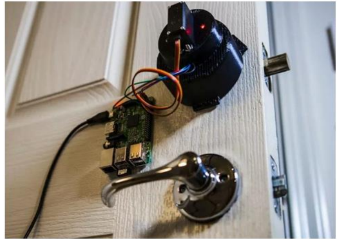
Fig.4: Result of the Smart Door System.

the advanced cell. This can facilitate the client. We utilized an IoT application called Blynk for this undertaking. Blynk effectively enables you to interface with a solitary chip board like the Raspberry Pi through their simple to-utilize SDK. Subsequent to downloading the application from the application store, we made another undertaking for a Raspberry Pi with "Association Type"WiFi. We made two parts in the interface. The first was a catch, associated with virtual stick 0, that control the condition of the servo engine. The second was a pop-up messages part to be cautioned when the entryway state changes. At long last, you'll need spare the Blynk verification token by tapping on the apparatus symbol inside the fundamental menu, at that point causation it to your email. This token will be utilized in the subsequent stage.