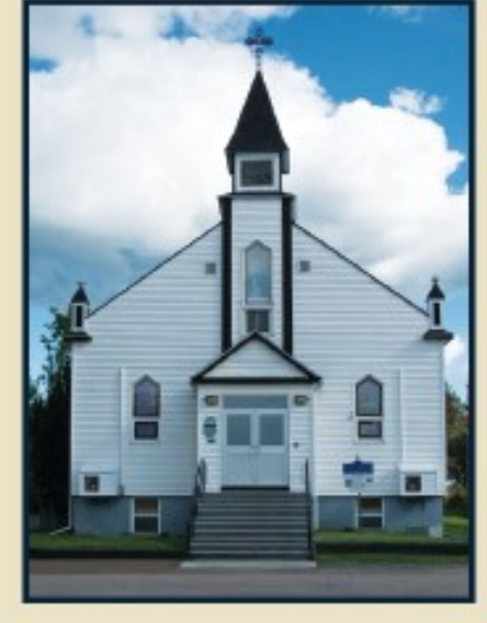
Saint Lawrence O'Toole Irishtown