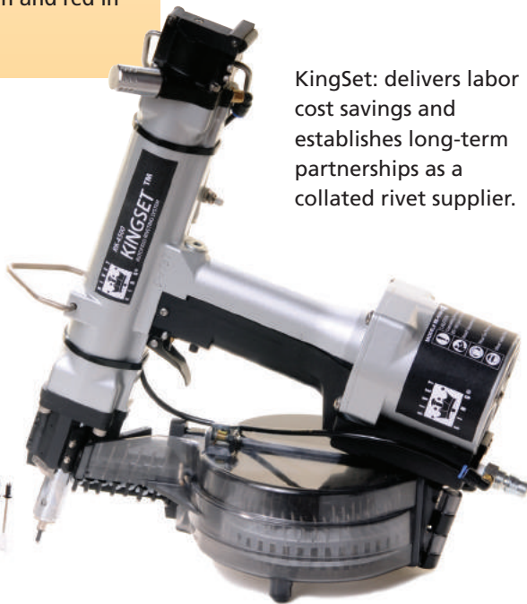
KingSet: delivers labor cost savings and establishes long-term partnerships as a collated rivet supplier.

A well-known manufacturer of leisure products, was finding that rivet nuts were not getting tightened enough on the assembly line. As a result, they had to fix the problem post-delivery by sending technicians to the consumer. With FreeSet's error-proofing capacity, the operator knows in real time if an install is good or bad with OK and NOT OK green and red indicators.