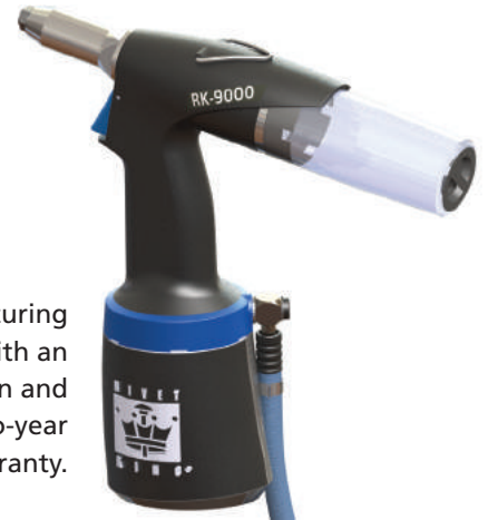
RK-9000: Featuring pneumatic riveters with an innovative design and unprecedented two-year warranty.

With this, Industrial Rivet and the RivetKing brands offer our distributors a true 360-degree solution they can provide to their customers that covers all facets of the process from manufacturing through to installation and – more importantly – that delivers a balance between price, quality and service.