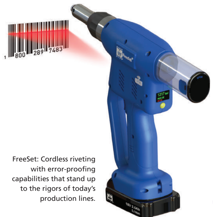
FreeSet: Cordless riveting with error-proofing capabilities that stand up to the rigors of today's production lines.