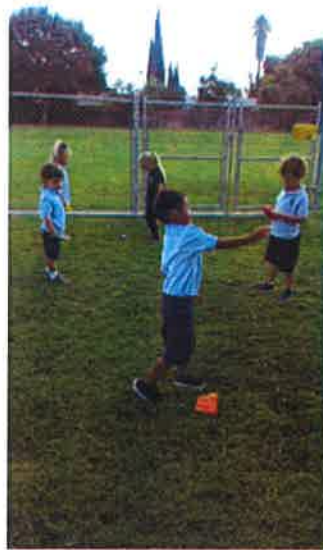
Pre-K children enjoying school.