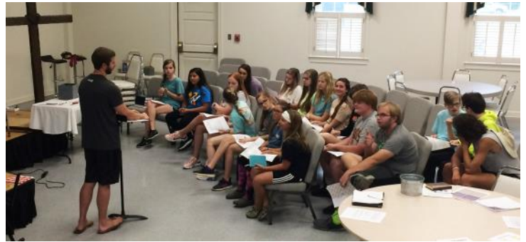
Wallace Students Beach Retreat Pre-Trip Meeting

"No ma'am," was the deep-voiced reply. "I'm just down here reading your gas meter."