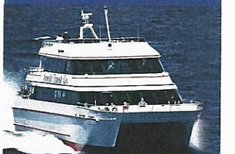
Mackinac Island Ferry