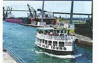
Soo Locks Cruise in Sault Sainte Marie