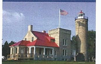
Mackinac Point Lighthouse