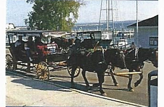
Tour Mackinac Island by Horse and Carriage

Diamond Tours ® inc. Bringing Group Travel to a Higher Standard ®