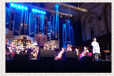
CPA KIDZ Concert 2015