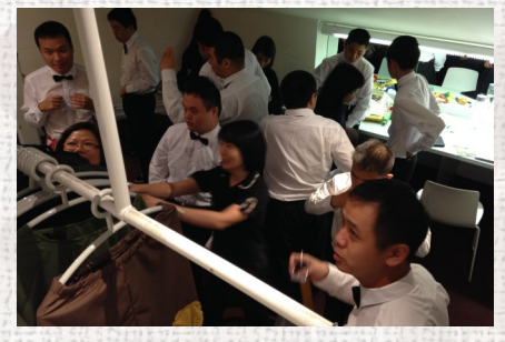
CPA KIDZ Concert 2015