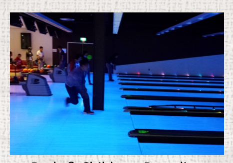
Dads & Children: Boweling