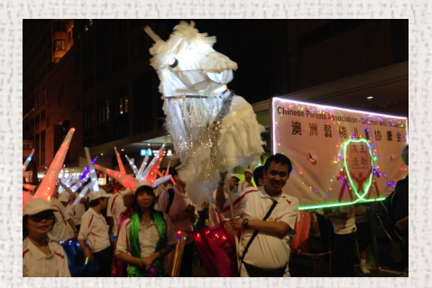
CNY Parade 2015