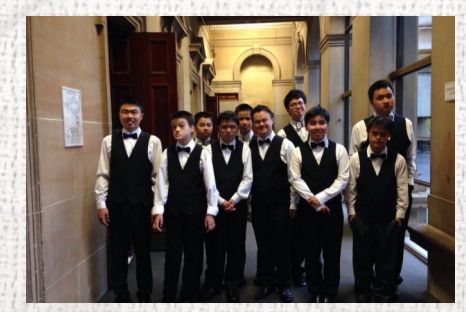
CPA KIDZ Concert 2015