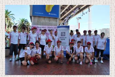
Dragon Boat Races 2015