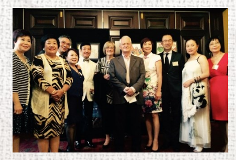
CPA KIDZ Concert 2015