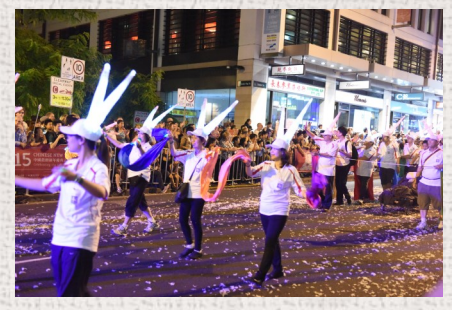
CNY Parade 2015