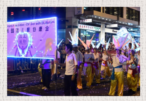
CNY Parade 2015