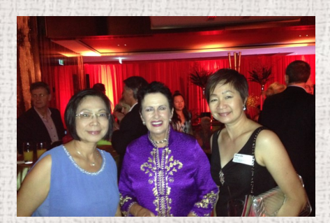
2015 Sydney CNY Festival Launch