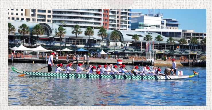
Dragon Boat Race 2015