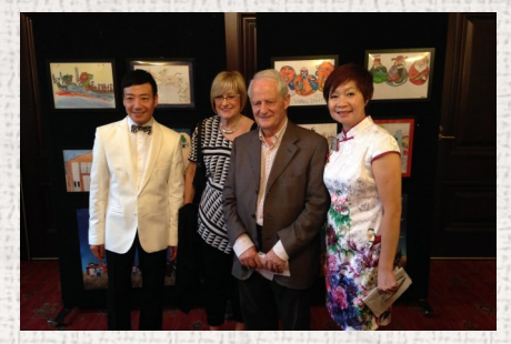
CPA KIDZ Concert 2015