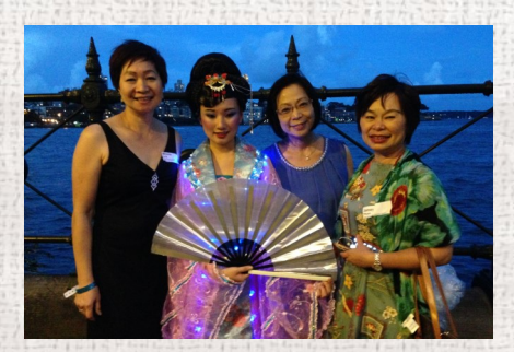
2015 Sydney CNY Festival Launch