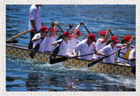
Dragon Boat Races 2015