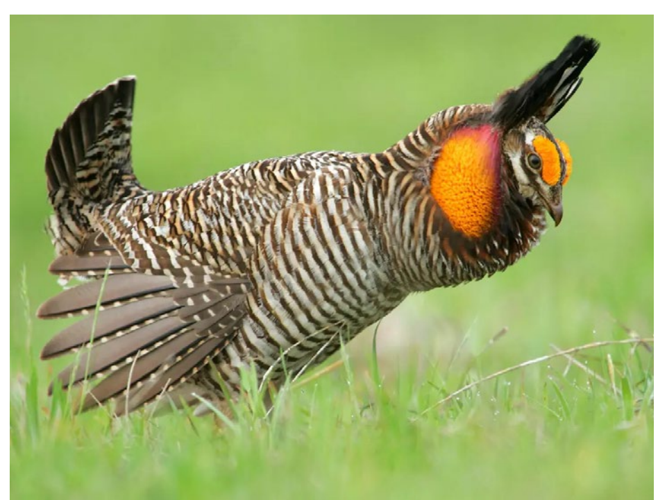
U.S. Fish and Wildlife Service

It's always a sad day when an animal goes on the endangered species list but Attwater's Prairie Chicken may be one that is able to come off the list someday. Let's hope!