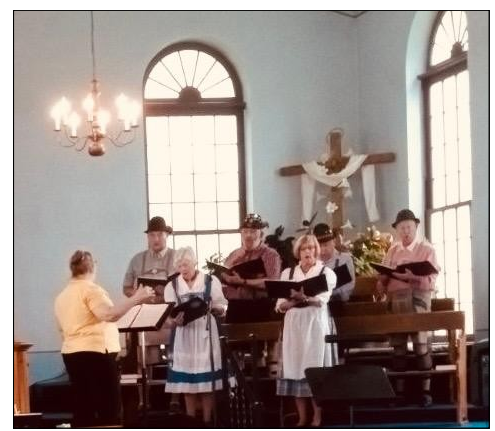
Singers in action at the MaiFest in Zoar, Ohio