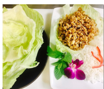
Chicken Lettuce Wrap