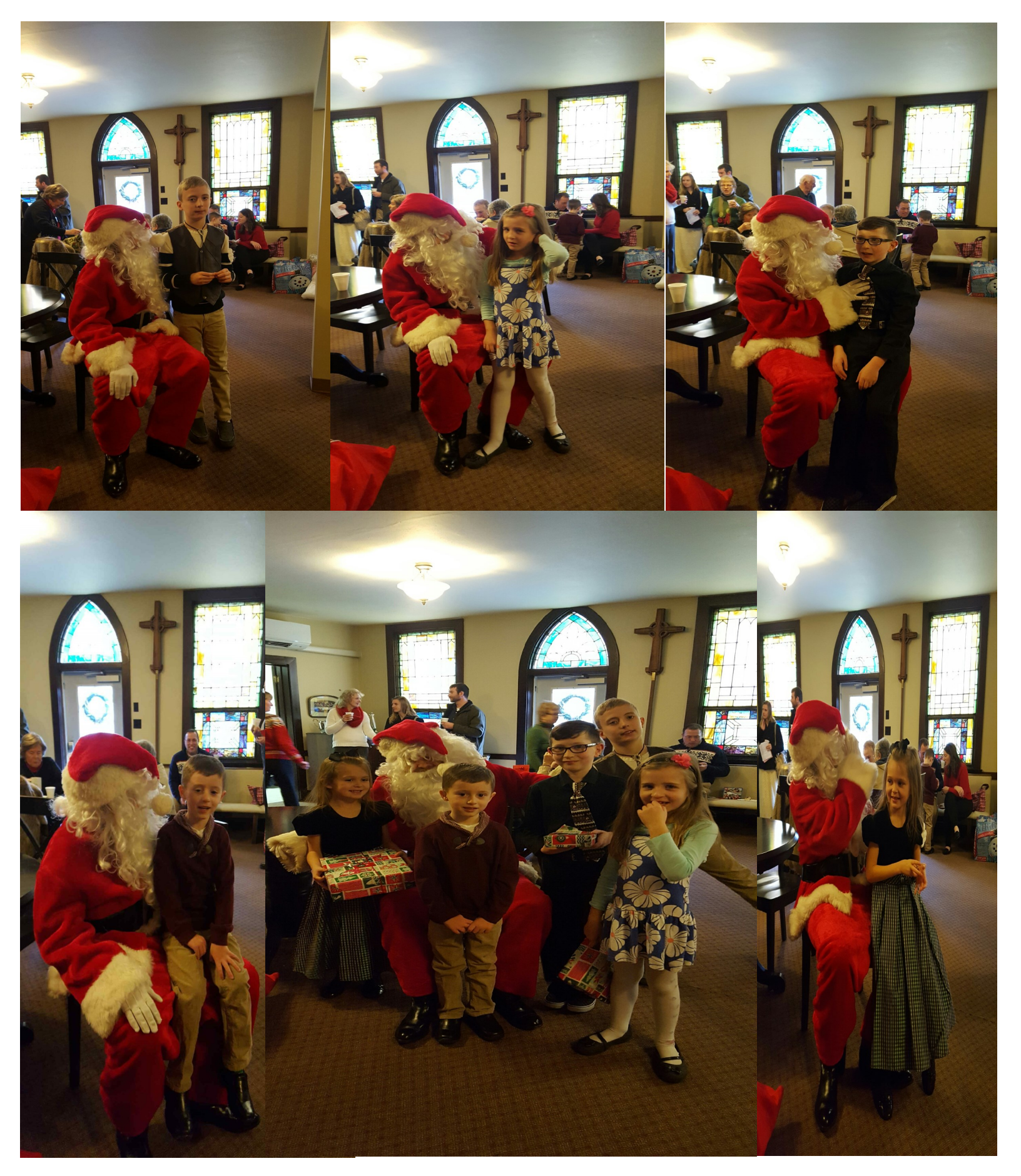
Santa stopped by Mars UP Church