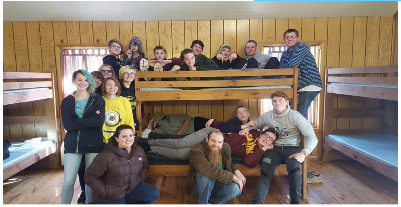
HIGH SCHOOLERS AT LAURELVILLE 2017