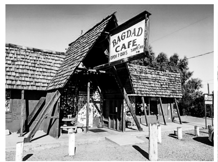
Barstow, CA's popular wedding venue on a budget.