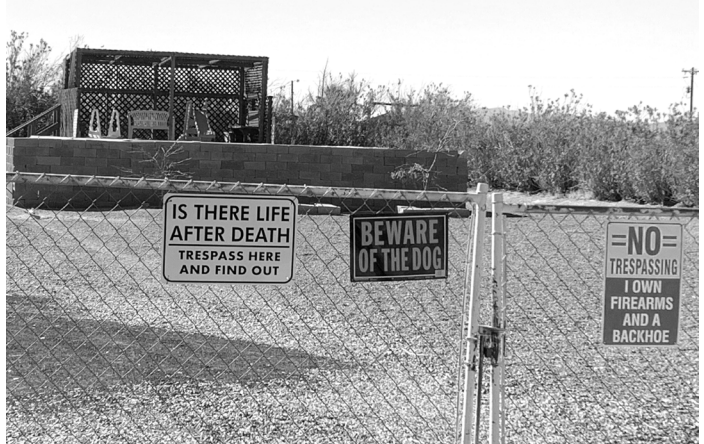
Mr. Grumpy has a bit of an attitude. I'd call to schedule a visit.

Check out the stop sign! That's something both political parties can agree on. By the way, this little town of Darwin exists in the over-regulated state of California without a town government.