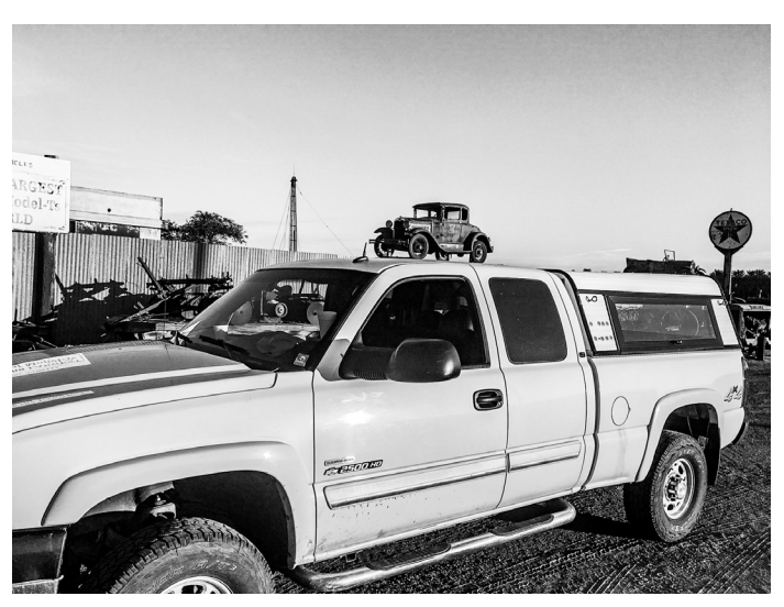
Has anyone seen my Model A?

My 1990 Nissan Maxima is now over 30 years old and its yearly registration was still over $60. The nice folks at the San Juan Co Auditors office showed me how to re-register my old friend as a "collector vehicle" that cost about $60 but only one time! No more paying THE MAN at least for Grandpa Max. Max is now a true Orcas Island Beater.