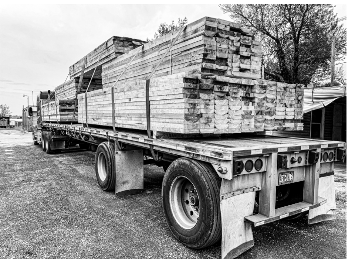
2021's Brinks Truck