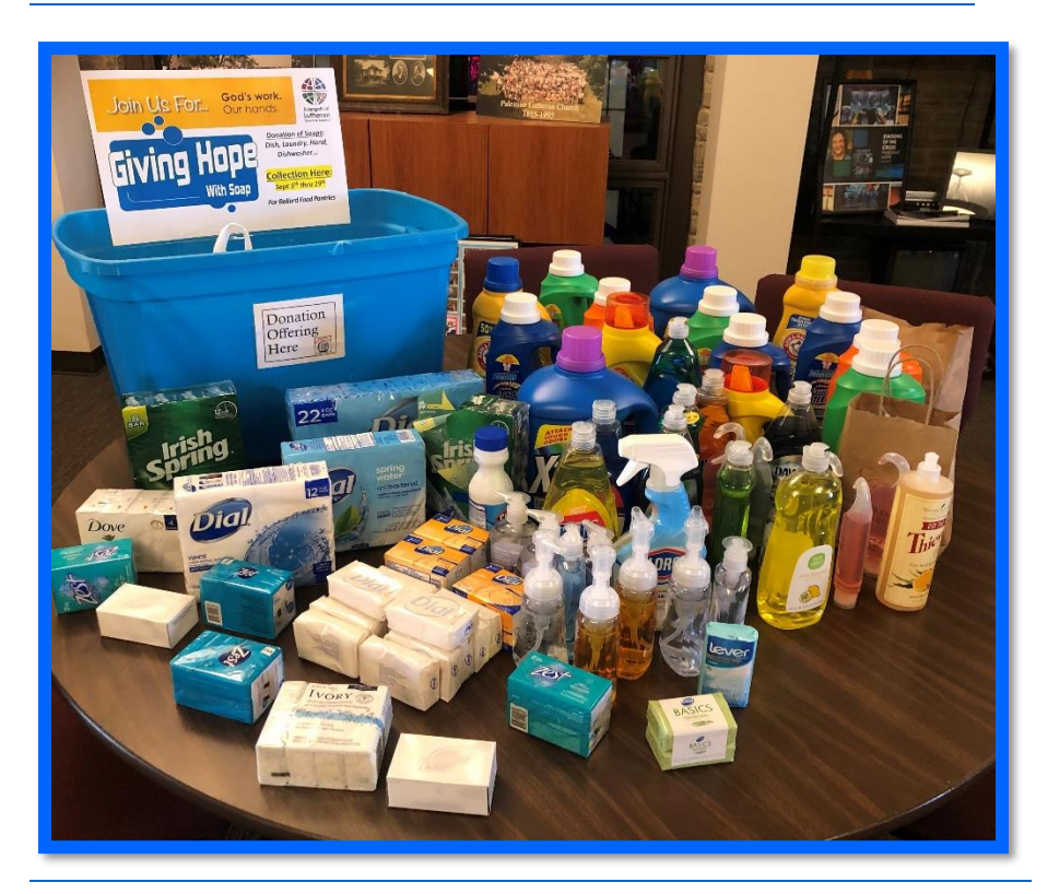
Our collection from God's Works, Our Hands! The soap will be appreciated.