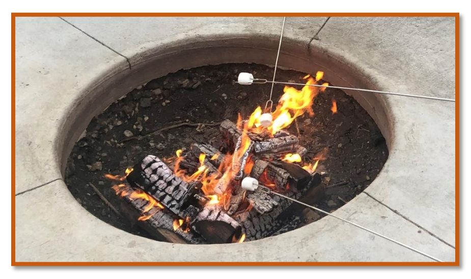
Our new firepit on the patio!