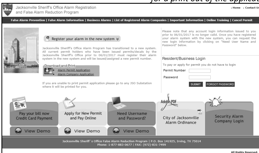
screenshot of the registration page

If you are not able to register online you may also visit any JSO substation for a print out of the application to mail in.