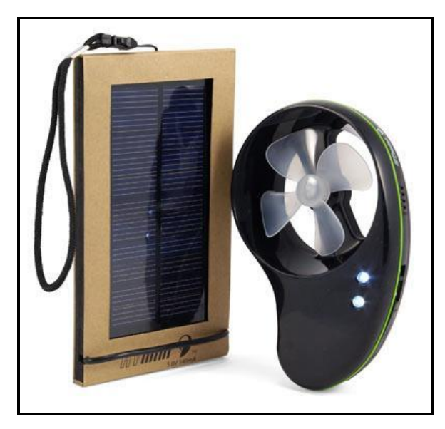
Fig.2: HYmini with Solar Panel

The HYmini also comes with five different connectors capable of charging just about every gadget found in your bag. Clip it to your bike or your armband to really maximize the wind power as shown in figure 3. HYmini wind unit itself, a solar panel that plugs into it, assorted adapters for different electronics, and a regular wall plug so you can charge the internal battery by regular power if necessary [3].