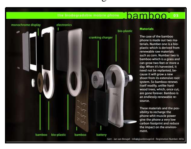
Fig.4: Bamboo Phone

This is a bio degradable cell phone concept designed as a nature-friendly phone. The casing is made of bio-plastic made of renewable natural resources like Corn and Bamboo, which, when harvested, grows back in due time as shown in figure 4.