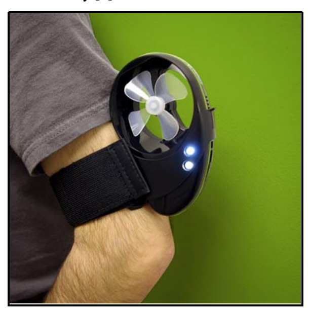
Fig.3: HYmini attached on arm

The HYmini also comes with five different connectors capable of charging just about every gadget found in your bag. Clip it to your bike or your armband to really maximize the wind power as shown in figure 3. HYmini wind unit itself, a solar panel that plugs into it, assorted adapters for different electronics, and a regular wall plug so you can charge the internal battery by regular power if necessary [3].