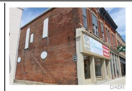
215 S Main Street Celina OH 45822