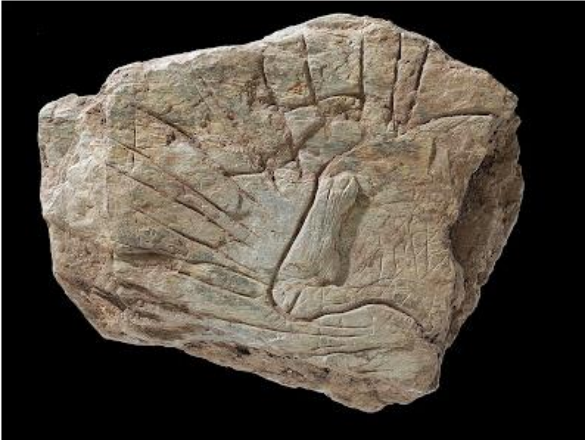
Engraved aurochs on schist plaque. Azilian, Le Rocher del'Imperatrice, France.

Realistic, larger-scale depictions of aurochs and horses provide evidence that cultural and religious beliefs had not totally abandoned the fascination in large animals found in previous cultures, and suggest that the evolution of these beliefs and mythology moved more slowly, lagging behind the evolution of tools to fit the new conditions the people lived in.