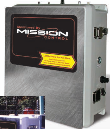
NEMA 4X Enclosure Option Shown

MISSION provides each customer with a secure website to view current status, run reports, or make updates. It even runs on cell phones.