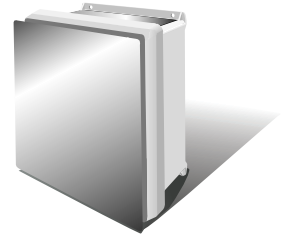
Outdoor NEMA 4X enclosure: Top and front sun shield 13.75" h x 13.25" w x 6.25" d (with sun shield)