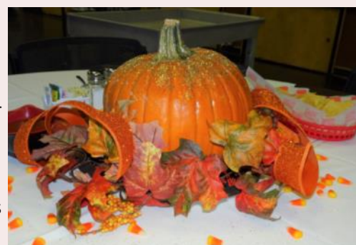
The lovely table centerpieces were made by Lavada Stevens