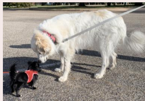
The best thing about a rally is reconnecting with friends!

Another great CC Texans Rally! Thanks to all who contributed!!