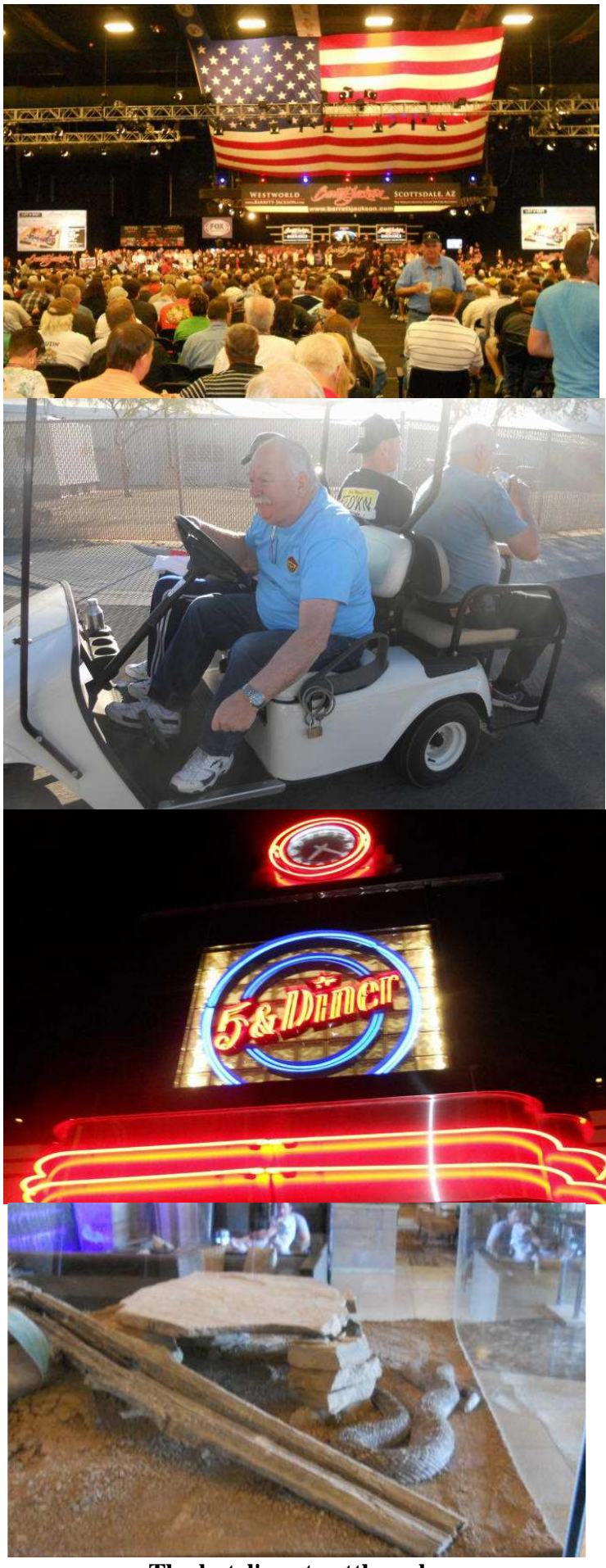
The hotel's pet rattlesnake