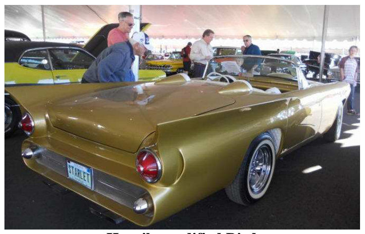
Heavily modified Bird