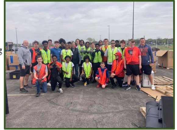
Above: Solvay High School Football Team volunteered at the Electronics Recycling Left: Solvay students volunteering at the Paper Shredding event at DestinyUSA in September.