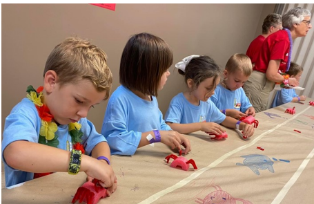
Arts & Crafts Fun