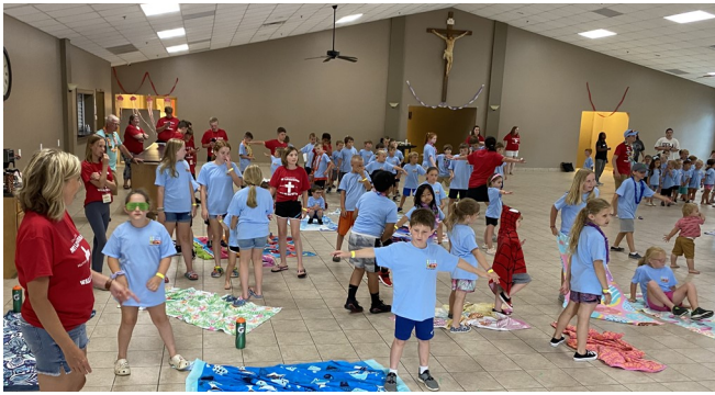
Music, Dancing & Prayer