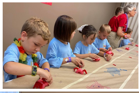
Arts & Crafts Fun