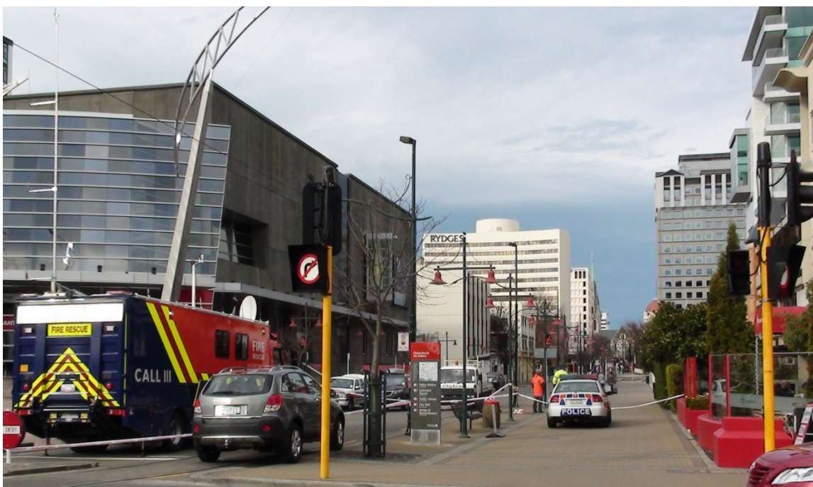
Looking towards Christ Church Cathedral from the Civil Defence headquarters at the Christchurch Art Gallery following the September earthquake